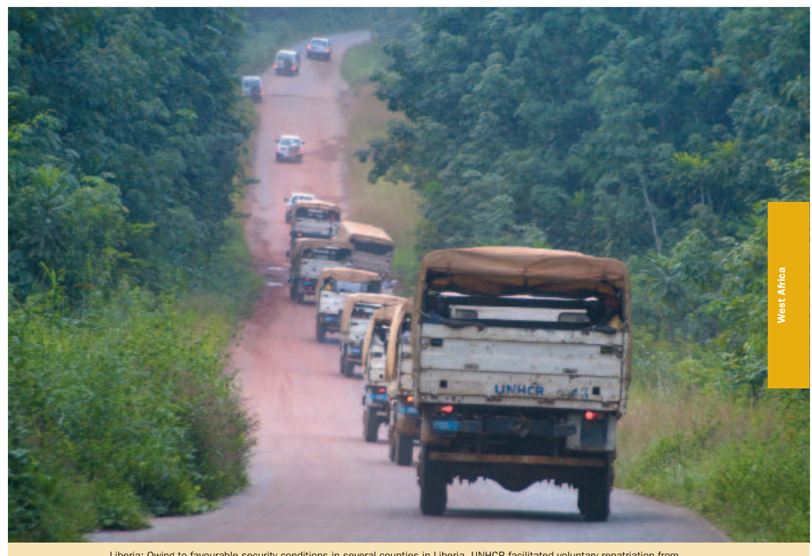
Liberia: Owing to favourable security conditions in several counties in Liberia, UNHCR facilitated voluntary repatriation from Guinea by road in November 2004. Here, a UNHCR convoy on the way to the border.

other items were distributed to over 3,000 vulnerable refugees and over 500 women received sanitary materials. Medical assistance was granted to some 5,600 refugees and five mentally ill persons were assisted in a psychiatric centre. Self-reliance projects were implemented for 38 persons. UNHCR assisted 429 children in need of primary education, provided secondary educational grants to 259 students and post-secondary educational grants to 12 students. Vocational training assistance was provided to 38 female refugees and 17 male refugees.