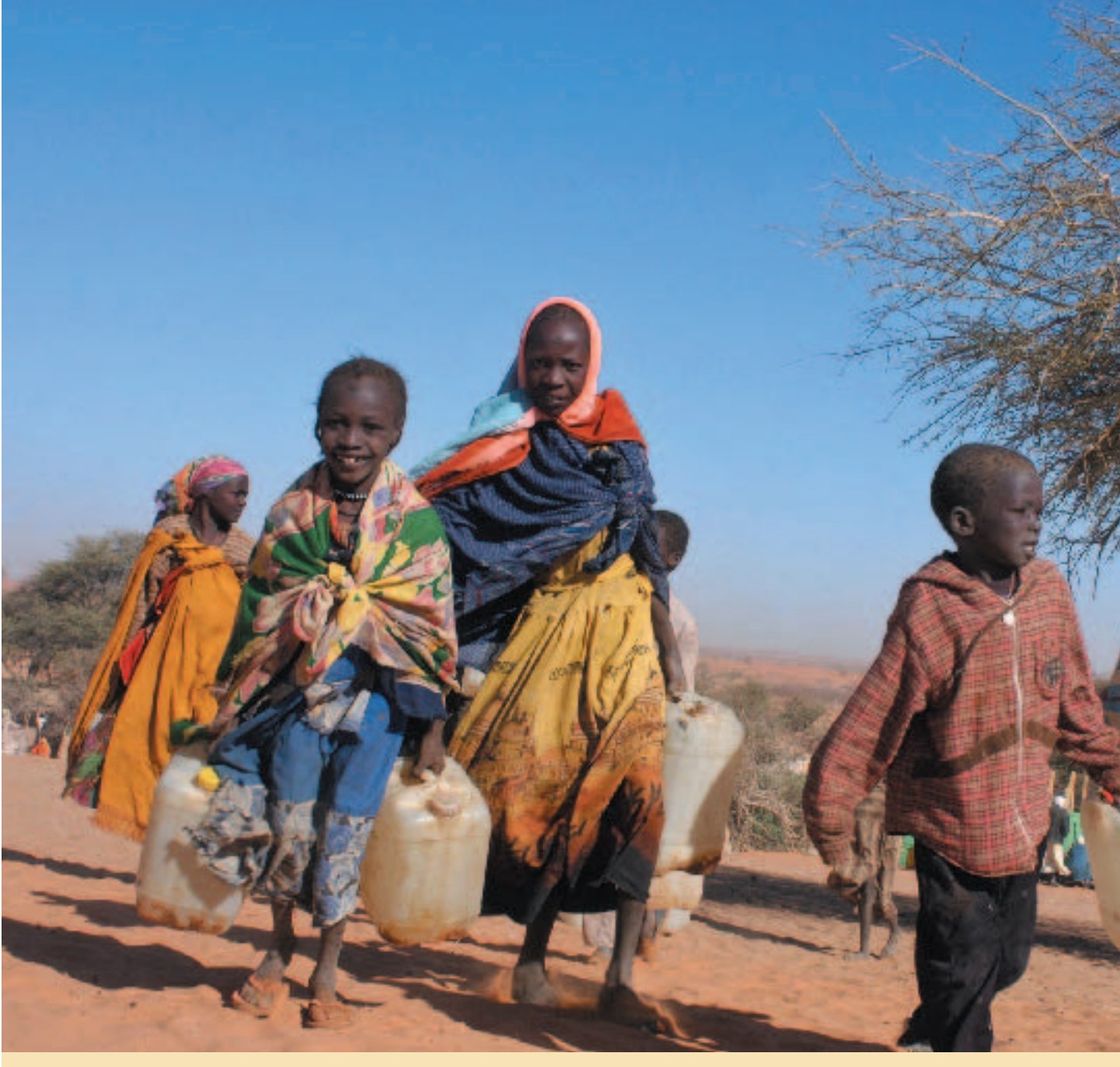
Chad: The search for water - young Sudanese refugees transporting water from the tap set up by Norwegian Church Aid teams in Touloum to their makeshift shelters in the transit centre site. UNHCR and its partners, together with the local authorities, raced against time to identify sites with enough water so that refugees could be moved from the border to camps further inland before the rainy season, which starts in May-June. At that time, the roads become impassable for trucks.