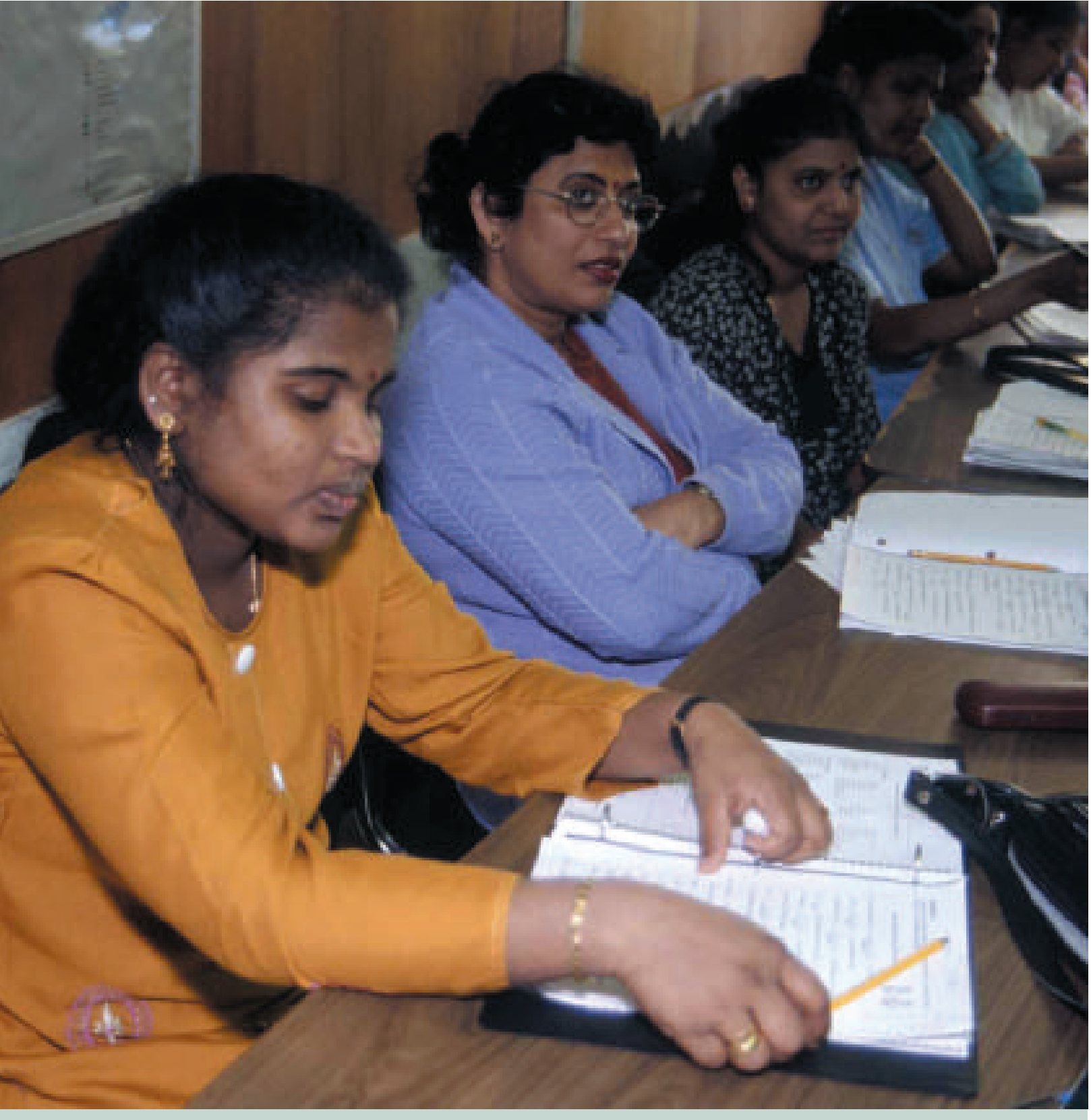
Canada: French lessons for resettled refugees.

Canada) and ensuring the provision of legal counsel to unaccompanied minors with asylum claims.