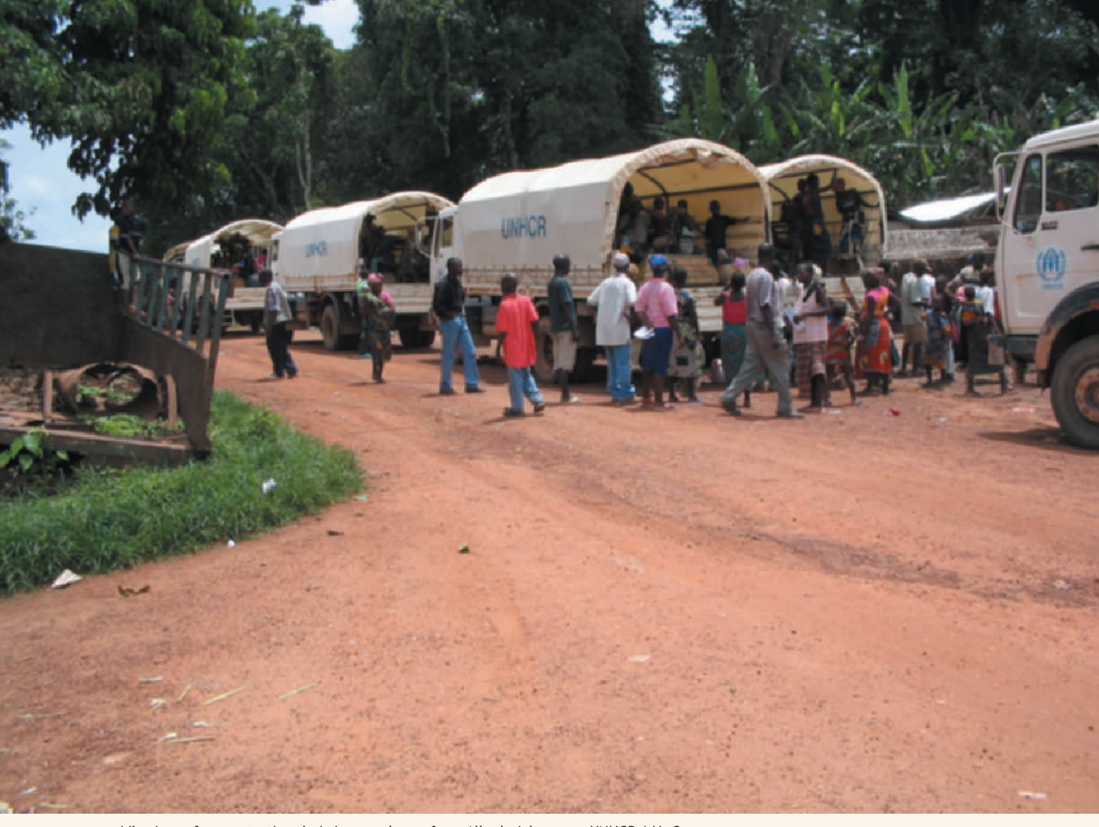
Liberian refugees starting their journey home from Albadariah camp.

Over the course of the year, over 66,000 new refugee attestations, serving as identification documentation, were issued to all registered refugees irrespective of age and sex (some 8,500 in Conakry, 12,500 in Kissidougou and 45,000 in Nzérékoré). This was an important step forward for camp-based refugees, whose only documentation until then had been their ration cards.