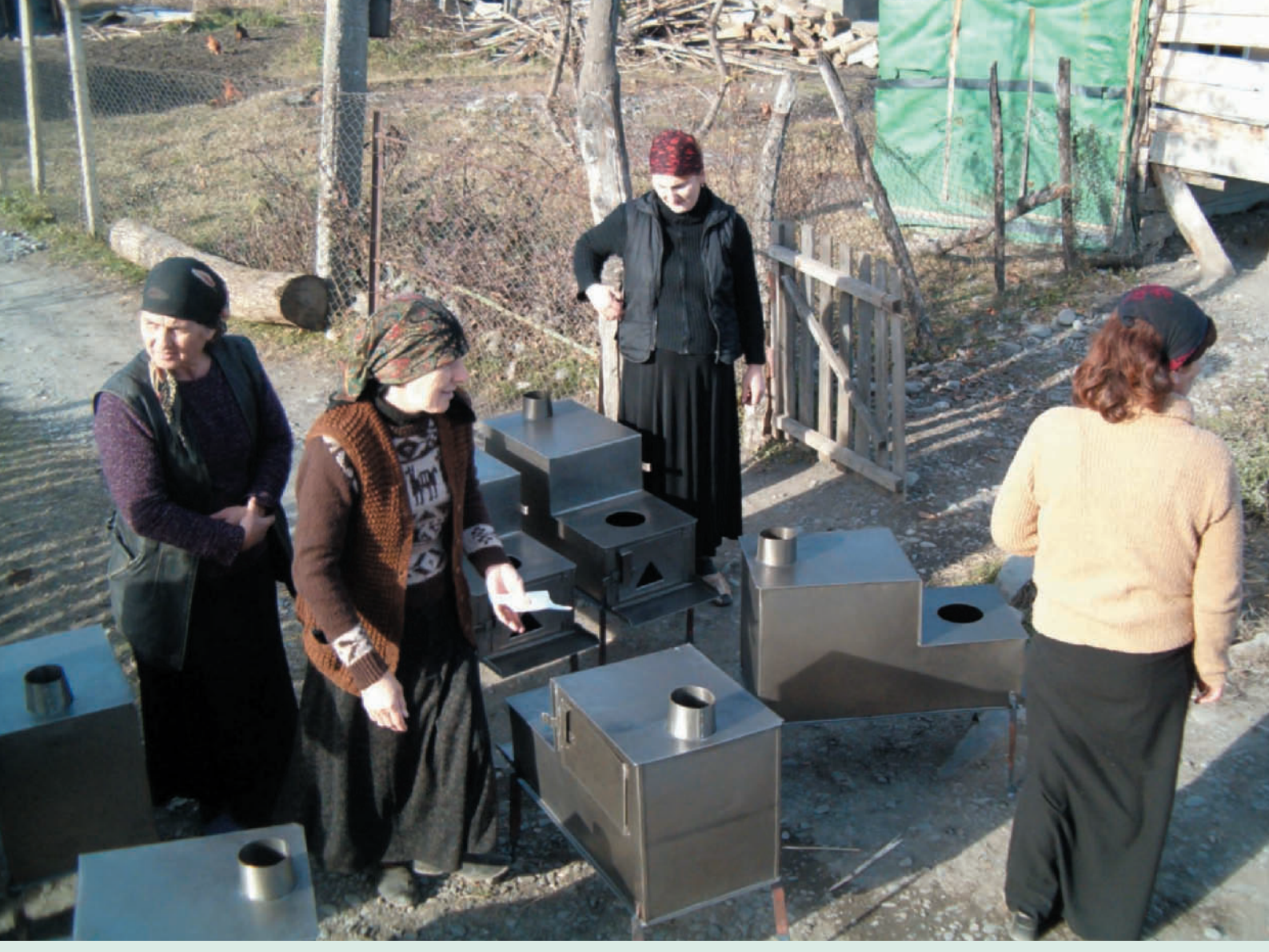
Georgia: Chechen refugees inspect UNHCR stoves before choosing which one to take home to their family. In a very harsh climate, the stoves are a coveted item, essential for cooking and heating. Provision of firewood has helped to protect the environment and to reduce conflict between refugees and local communities.

continued to have difficulty in accessing the territory and/or asylum procedures.