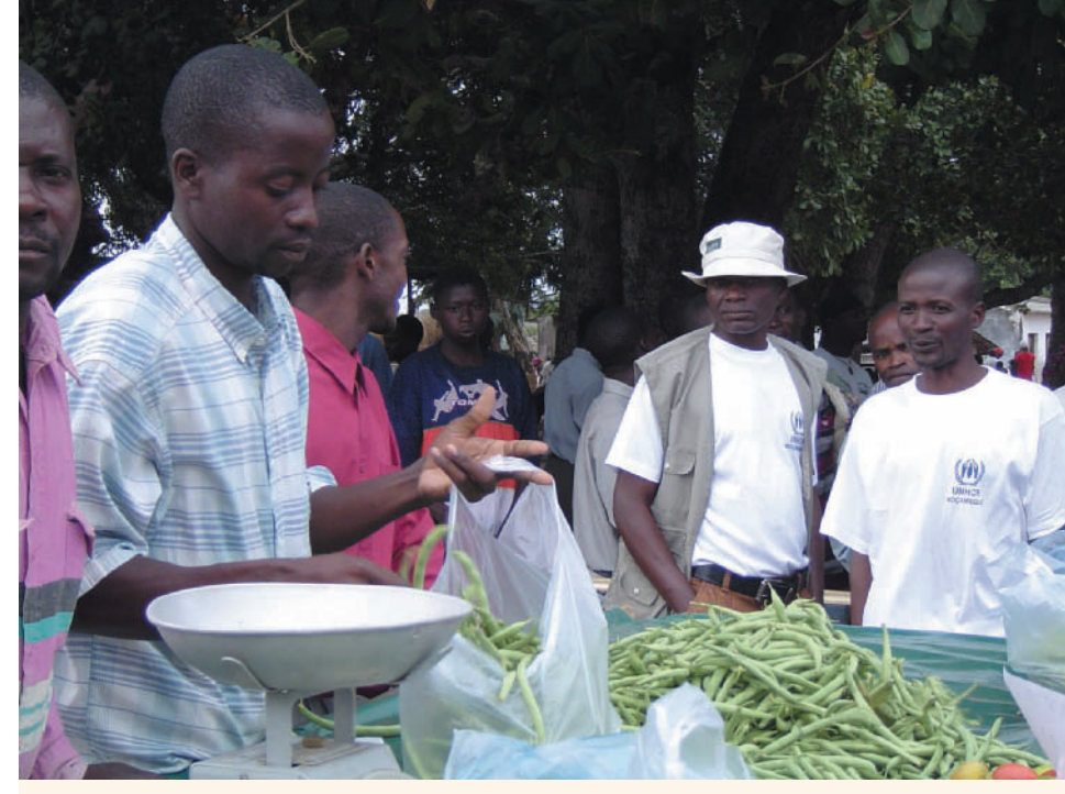
Mozambique: Refugees in Marratane Camp, show their produce during the celebrations of World Refugee Day.

The Government of Mozambique hosted approximately 6,000 refugees and asylum-seekers from DRC in 2005. A total of 4,000 refugees were assisted in Marratane settlement in northern Mozambique, and the remainder in various locations, in line with the Mozambican Government's policy of permitting self-sufficient refugees and asylum-seekers to live outside the settlement. The issuance of identity cards by the Government to all refugees and asylum-seekers in the country was a significant step forward in the protection of persons of