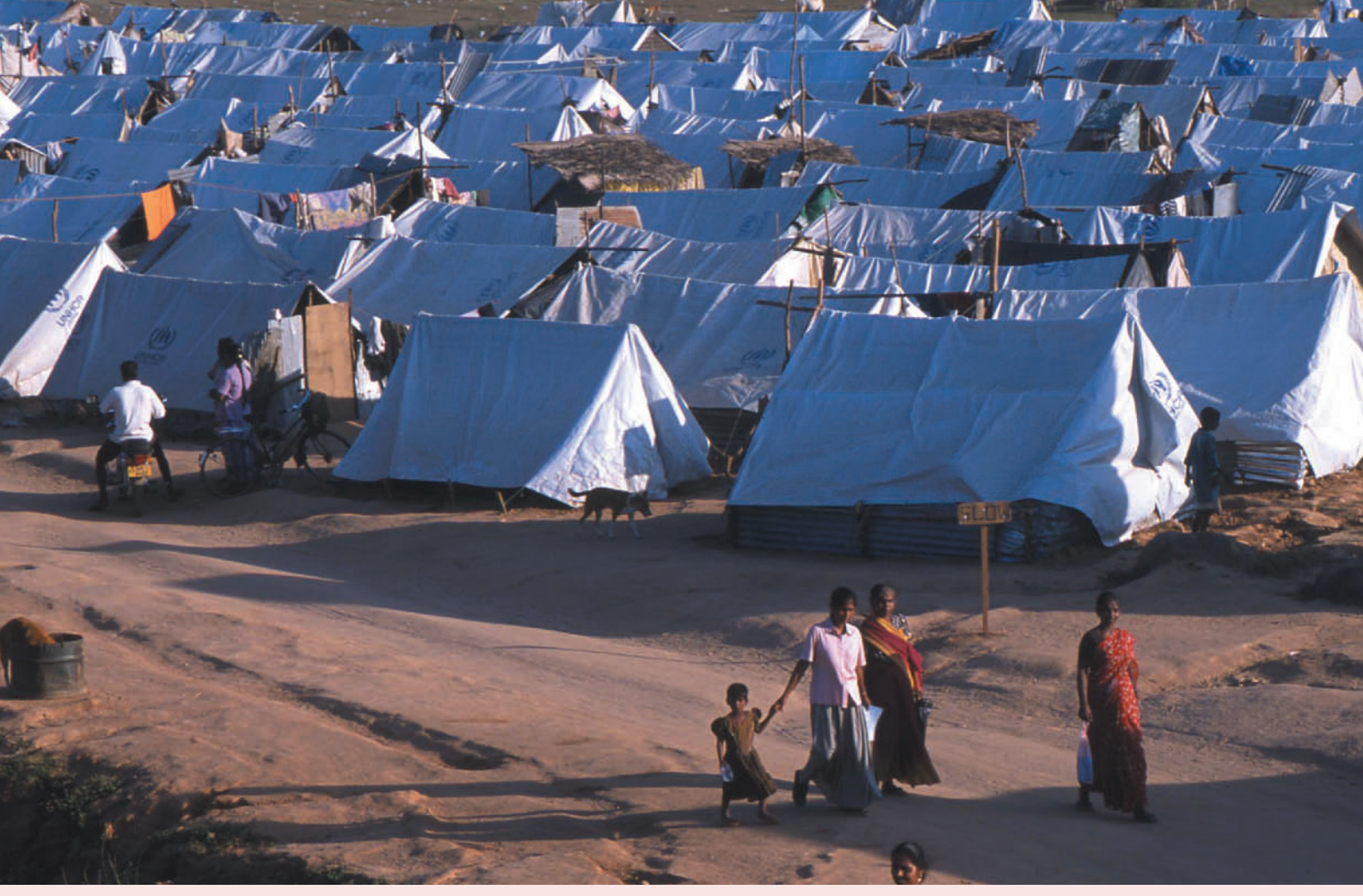
Sri Lanka: An IDP settlement in the old section of Guyatree Mandanai Temple, Tirukkouil district.

The launching of the age, gender and diversity mainstreaming initiative enabled field operations to revise assistance and protection strategies to effectively respond to refugees' individual needs.