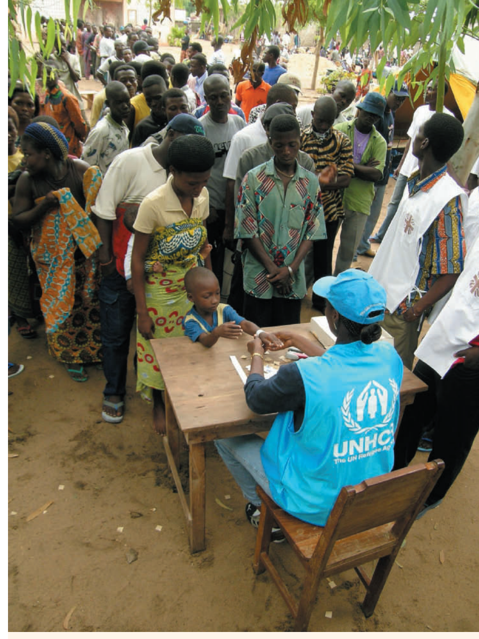
Benin: UNHCR registers Togolese refugees and hands out wristbands near the border town of Hilakondji.

UNHCR continued its efforts to find durable solutions for the Mauritanian refugees living in Senegal and Mali since 1989. The Office proposed a political approach through diplomatic exchanges involving the three