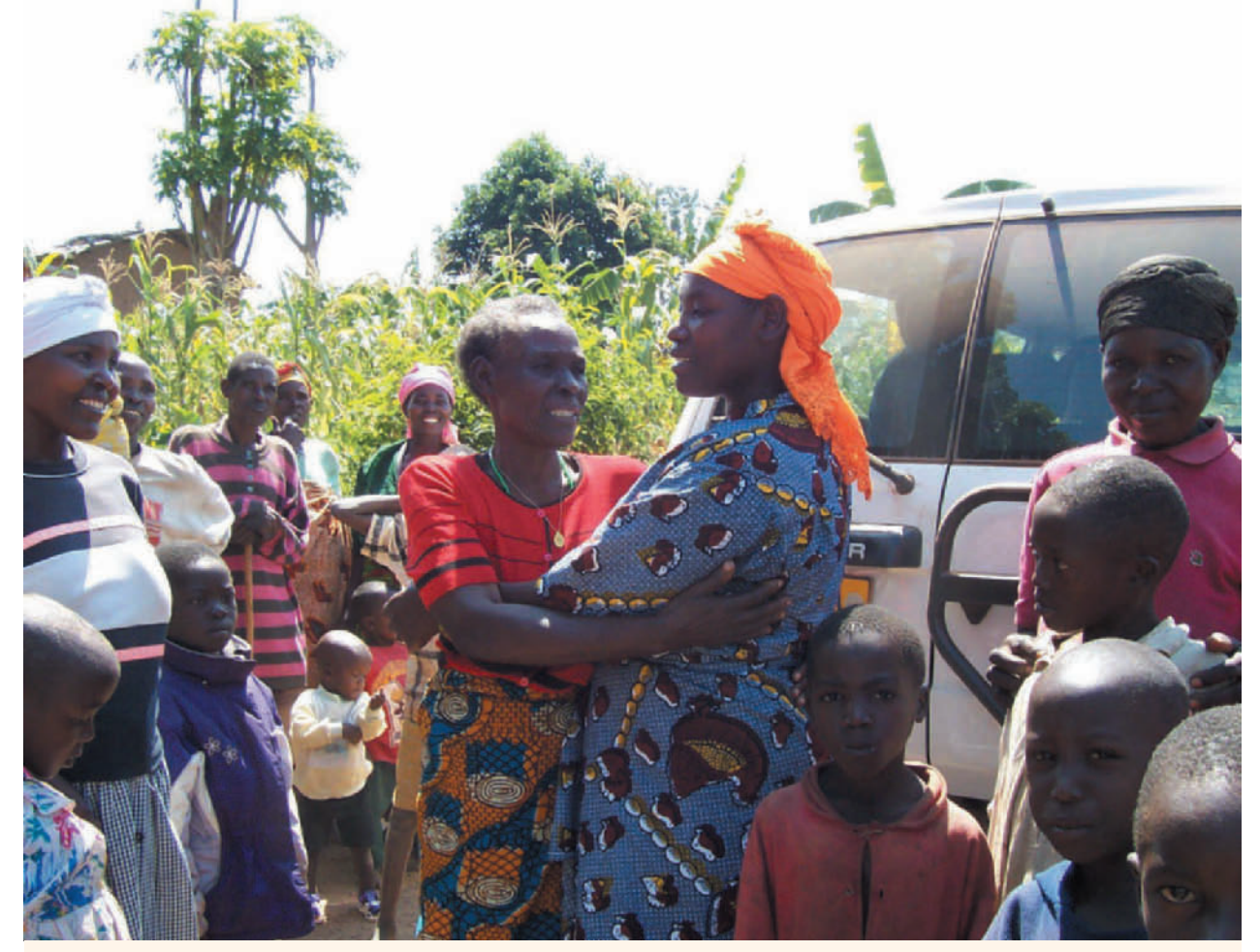
A Rwandan refugee (right) bids farewell to her mother as she heads back to Malawi at the end of a "go-and-see" visit, organized by UNHCR to her old home in southern Rwanda.

asylum-seekers to the transit centre of Nkamira in order to regularize their applications for asylum and to ensure their protection.