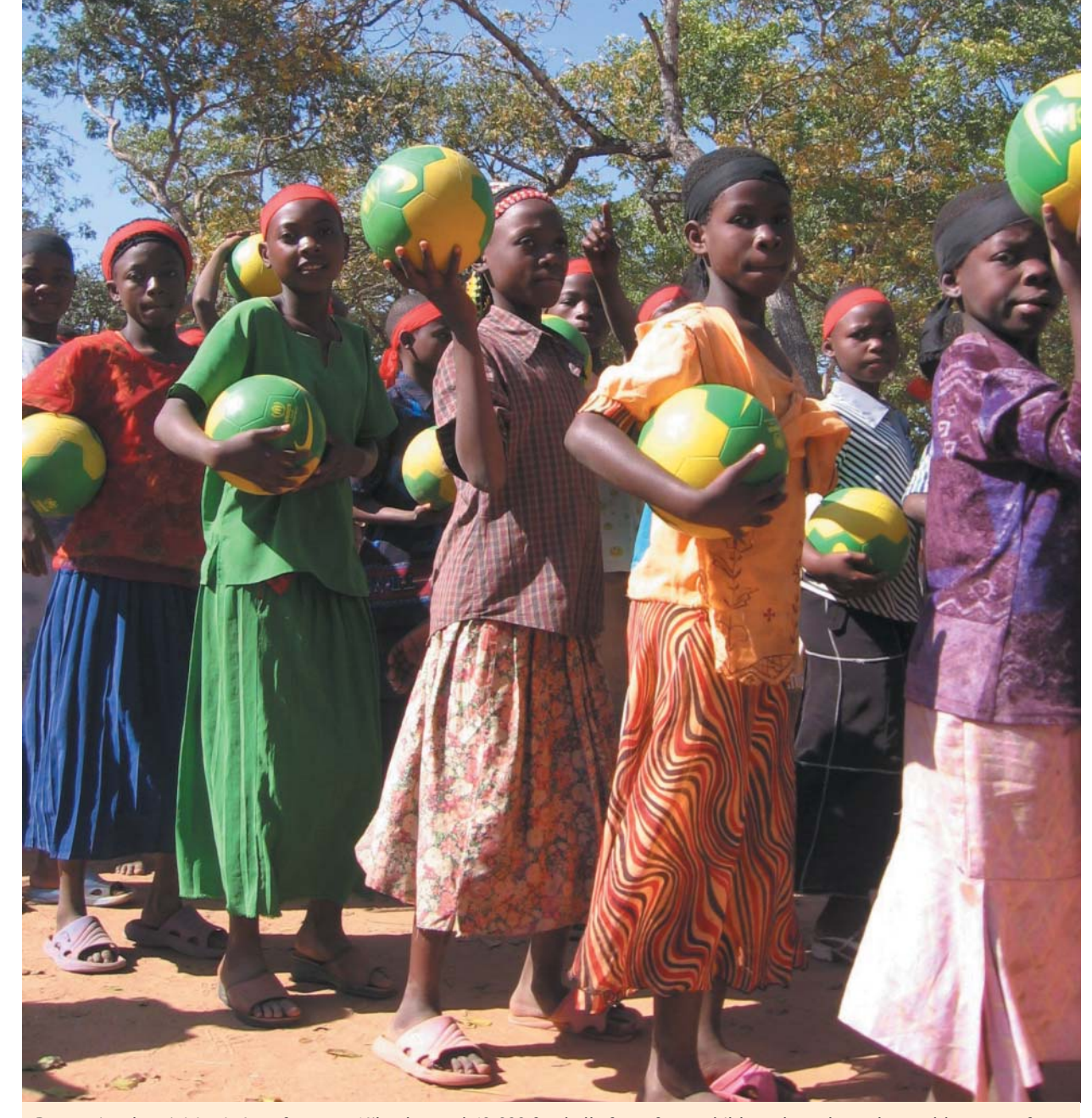
Recreational activities in Lugufu camp. Nike donated 40,000 footballs for refugee children throughout the world as part of their ninemillion.org campaign.

Progress towards durable solutions for refugees in Tanzania is closely linked to developments in Burundi and the Democratic Republic of the Congo (DRC). In Burundi, further stabilization and democratic presidential elections have prompted UNHCR to actively promote return, leading to an increase in repatriation towards mid-2006. However, a drought, political troubles and limited reintegration capacity have kept overall returns in 2006 at a moderate level. Nonetheless, it is hoped that the majority of the Burundian camp-based refugees will return in 2007, especially with the recent signing of a peace agreement between the Government of Burundi and Front national de libération (FNL).