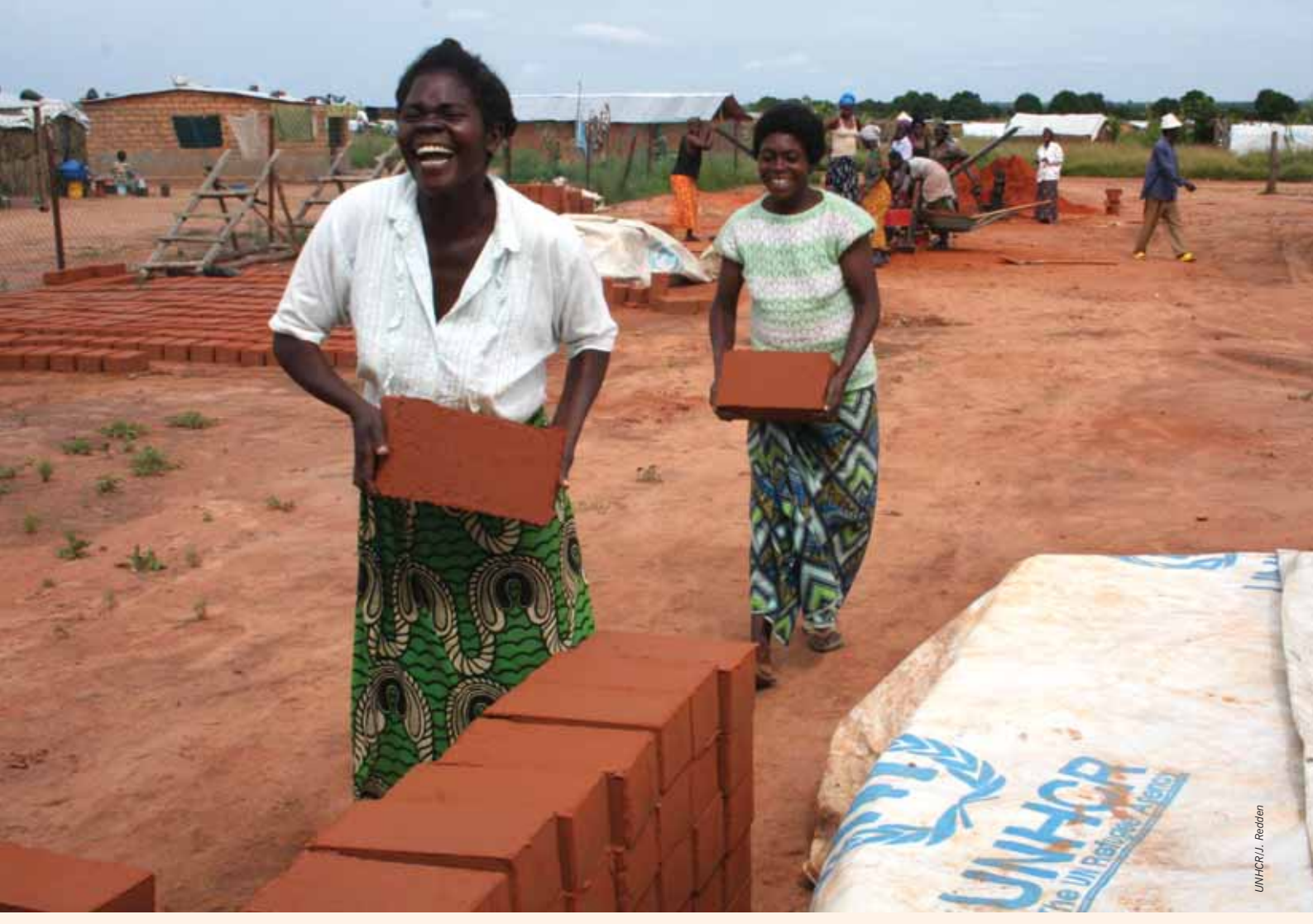
Returnee women participate in the construction of a women's centre supported by UNHCR in north-eastern Angola.

At the beginning of the year, a total of 105 personnel supported the operation, including 40 international and 65 national staff. By the end of 2006, UNHCR had reduced its workforce to 74 people, with 32 international and 42 national staff.