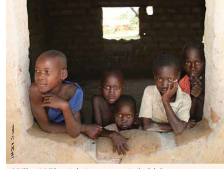
UNHCR and UNDP carried joint assessments in Aloi Sub County, Lira District, where this school is found.

UNHCR's objectives were to provide international protection and assistance to refugees while pursuing durable solutions for them; promote greater self-reliance and the integration of refugee services into national structures; expand the Development Assistance to Refugees (DAR) programme and ensure its full ownership by the Ugandan Government; ensure that the new Refugee Bill goes into effect and that government