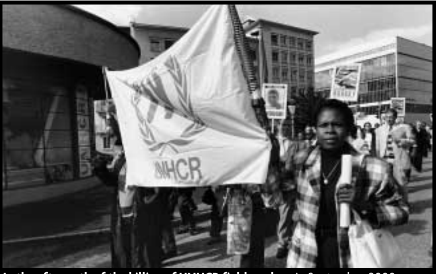
In the aftermath of the killing of UNHCR field workers in September, 2000, colleagues stage a protest rally in Geneva. Thousands of people worldwide signed a petition demanding the Security Council address the issue of security.

There is a dangerous security contradiction in all humanitarian work these days. Refugees are most in need of assistance at the very moment when relief workers are most exposed to danger. In East Timor in 1999 humanitarian officials suc-