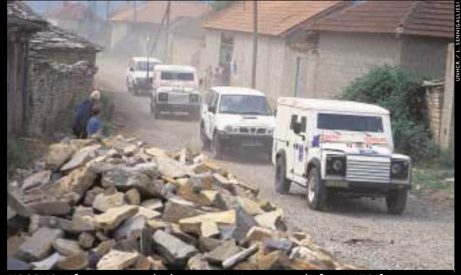
KOSOVO: Life was extremely dangerous in Kosovo even before NATO forces intervened in 1999 and UNHCR field teams regularly monitored the conditions of the province's civilians and provided assistance.