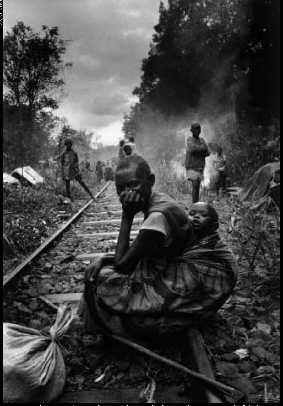
ZAIRE: Refugees in the rain forests of Central Africa in desperate need of help.