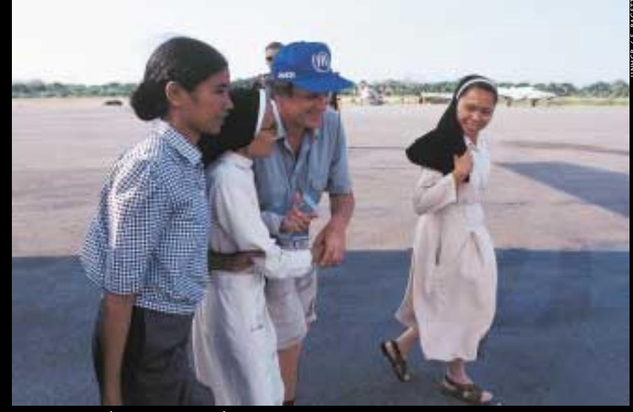
TIMOR: Civilians return to their homes in East Timor from West Timor.

*** WEST TIMOR, 1999 e began at the crack of dawn to pick up 300 refugees who were anxious to return home from West to East Timor, but their camp was