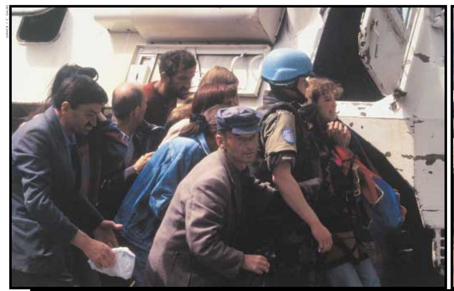
Military units, either from individual countries or forming part of a U.N. peacekeeping force have helped in many humanitarian opera a UNHCR official cooperates with an Ethiopian U.N. soldier to help refugees.

U.N. organizations and non-governmental organizations.