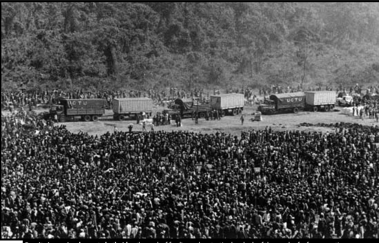
Despite increasing danger to both sides, the work of feeding and protecting hundreds of thousands of refugees continues

▶ but their sacrifice is rarely addressed. How to help families of these victims has never been officially resolved and the only compensation they have received on occasion has been private donations from other, luckier colleagues.