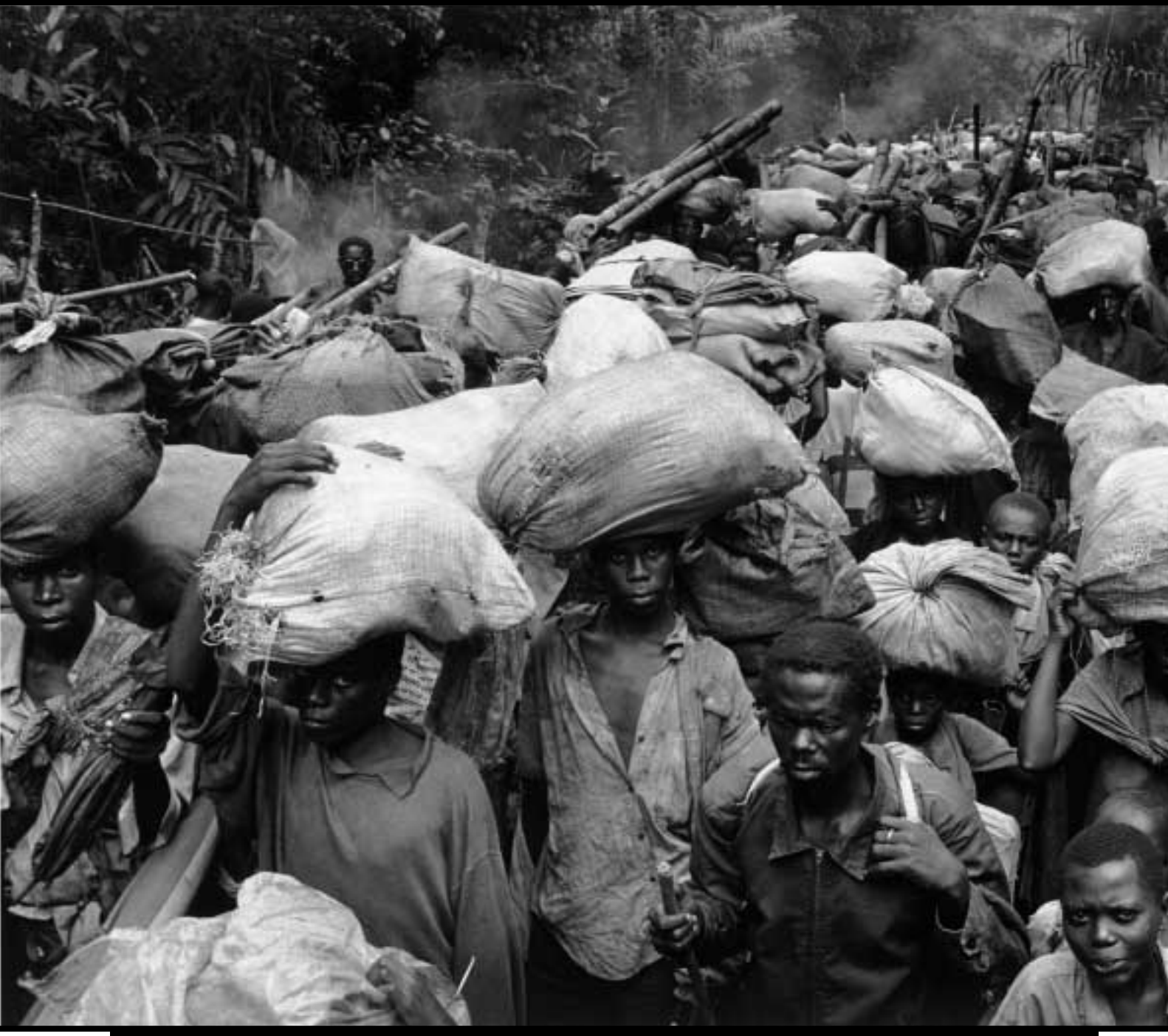
The international debate recently focused on the safety of aid workers. But increasingly, refugees such as these Rwandans near the Zaire town of Kisangani in 1997, are being deliberately targetted by warring factions.

▶ and Tutsi refugees. The car was surrounded on all sides. The Congolese had automatic weapons. The refugees had machetes and spears. The mob started to scream.