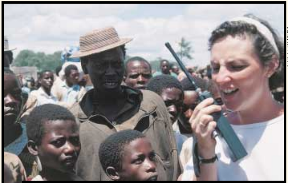
Conditions in refugee camps can often be difficult and dangerous. A relief worker surrounded by anxious civilians contacts base office via a field telephone.