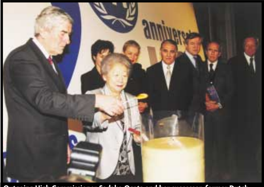
Outgoing High Commissioner Sadako Ogata and her successor, former Dutch Prime Minister Ruud Lubbers, with other former High Commissioners, at December 14 ceremonies in Geneva to mark the 50th anniversary of UNHCR.