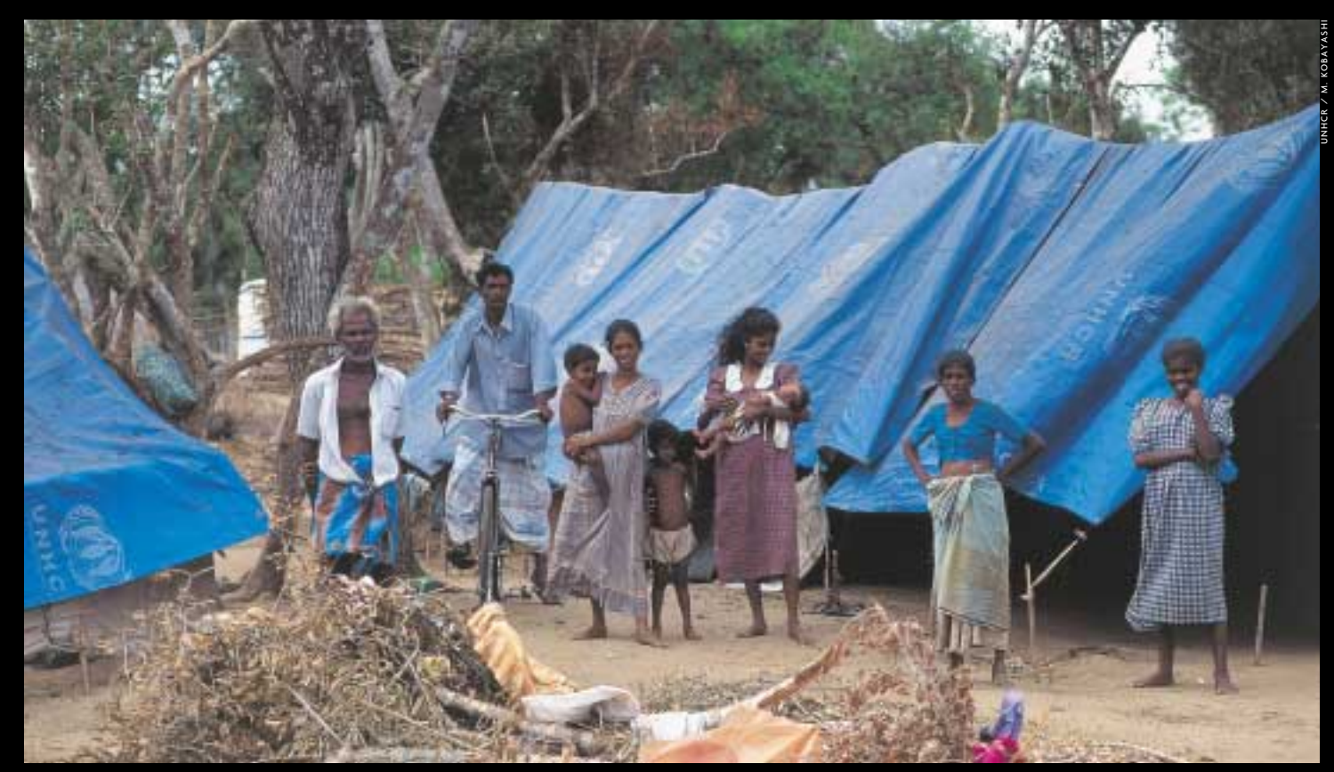
SRI LANKA: Relief workers must often cross dangerous no man's land between government troops and Tamil guerrillas to reach internally displaced civilians.

Security problems have become an everyday headache for humanitarian workers, whether from huge international organizations or small, private agencies. The outside world hears about the worst of these incidents, the high profile killings