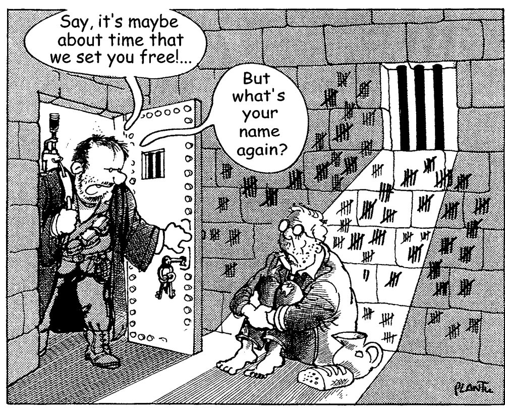
PRODUCED BY THE SUPPORT COMMITTEE FOR VINCENT COCHETEL