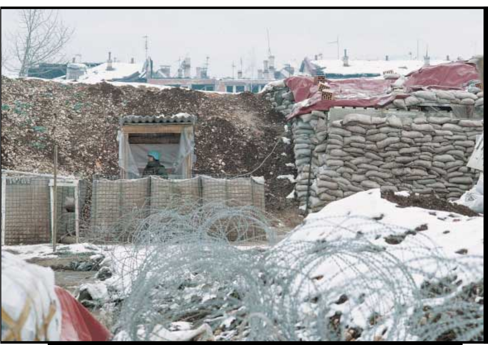
Sarajevo: In addition to safety worries, working and living conditions in the field are often extremely difficult.

The Convention covers only personnel engaged in operations specifically authorized by the Security Council or the General Assembly, resulting in bizarre situa-