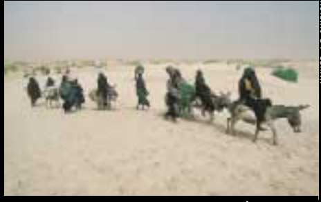
MALI: Returnees en route to market.

e were returning to our land cruiser in northern Mali after meeting with a Tuareg returnee leader when two turbaned masked men brandishing Kalashnikov rifles burst from an abandoned building.