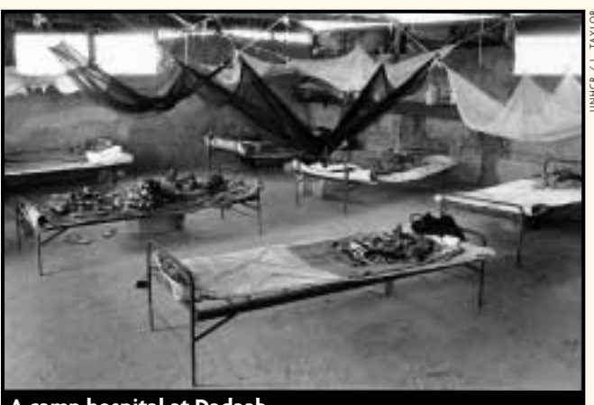
A camp hospital at Dadaab.

UNHCR and other humanitarian programs addressed the problem by integrating their programs, combining key