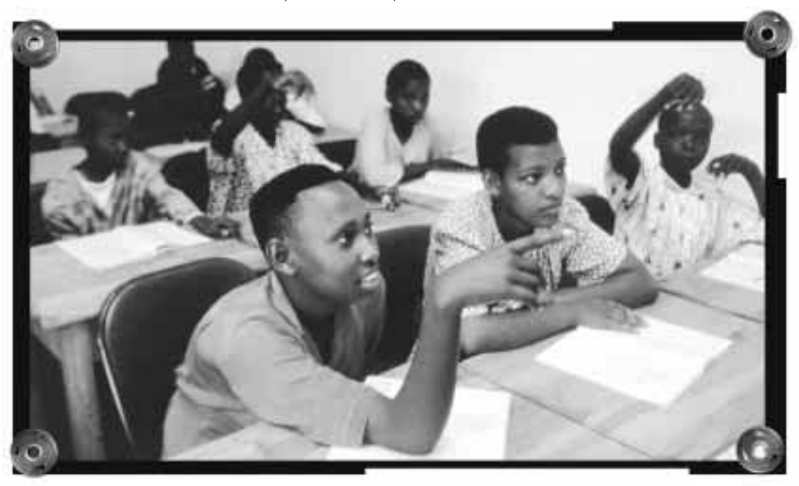
Returnees at the Club Mamans Sportives, a Rwandan Women's Initiative for adult literacy training, Rwanda.

The Jesuit Refugee Service (JRS) has a strong commitment to refugee education world-wide, with programmes in 13 countries in Africa. It has developed an education resource centre in Nairobi which houses materials on education for refugees and from emergency-prone countries.<sup>29</sup> Many other NGOs should also be mentioned here, but space does not permit.