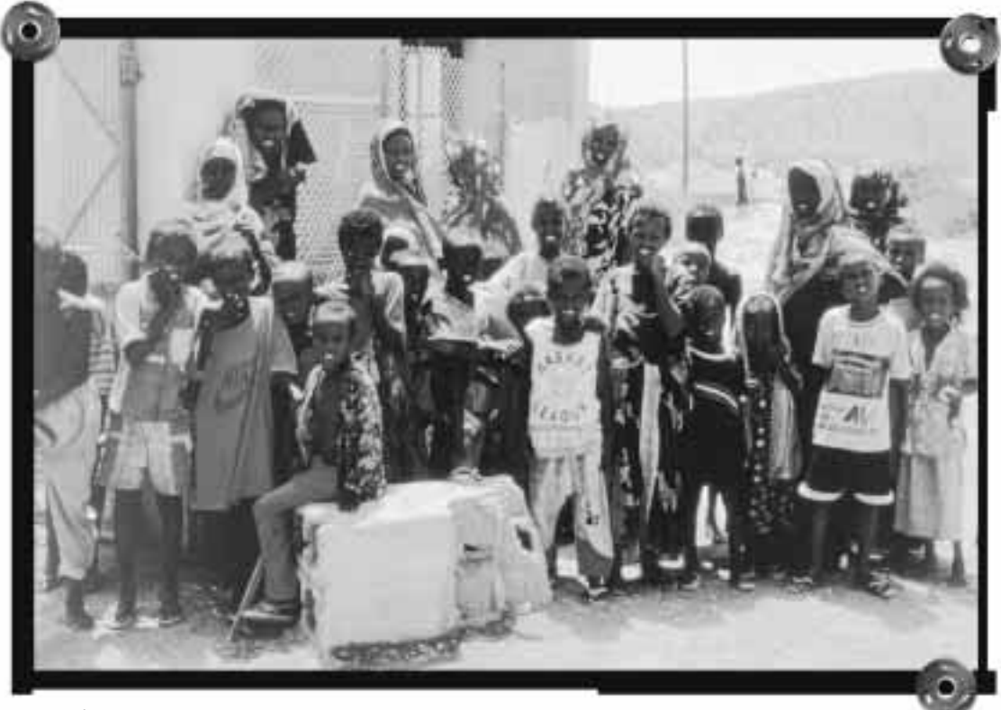
Somali refugees and returnees at the Emkulu Camp, Eritrea.

The Eritrean government decided to reconvene schools during the summer vacation to enable students to prepare for and sit their end-of-year examinations, so that they could be assigned to the appropriate class for the next school year. UNHCR was supporting repatriation and felt that refugees could return in safety to Eritrea to take advantage of these arrangements. It was planned that refugees who do not return to Eritrea will be relocated to an older camp in the same locality (where there is refugee schooling that follows the Sudanese curriculum). At the time of writing this relocation has been delayed by insecurity.