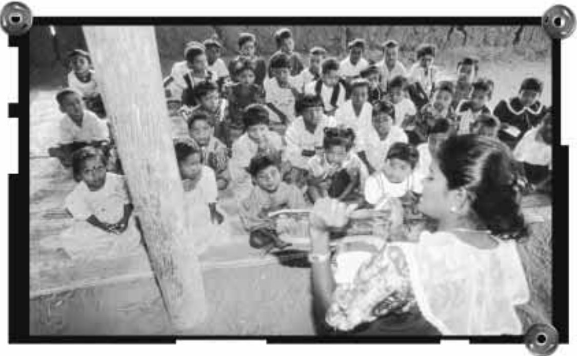
Refugee and returnee children at school in Madhu, Sri Lanka

The paper focuses on education specifically organized for emergency-affected children and young people,<sup>4</sup> and does not cover the topic of scholarships or other arrangements for displaced children to attend local schools or colleges.<sup>5</sup> Furthermore, it adopts a descriptive approach, being more a survey of the state of the art than testing hypotheses, not least because there is very little feedback in terms of published monitoring data or evaluation studies with which to verify results.<sup>6</sup> The underlying hypotheses are as follows: