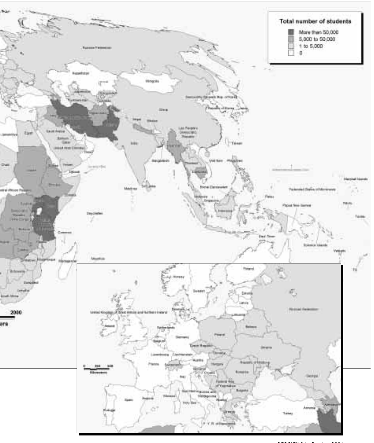
PGDS/GIMU - October 2001