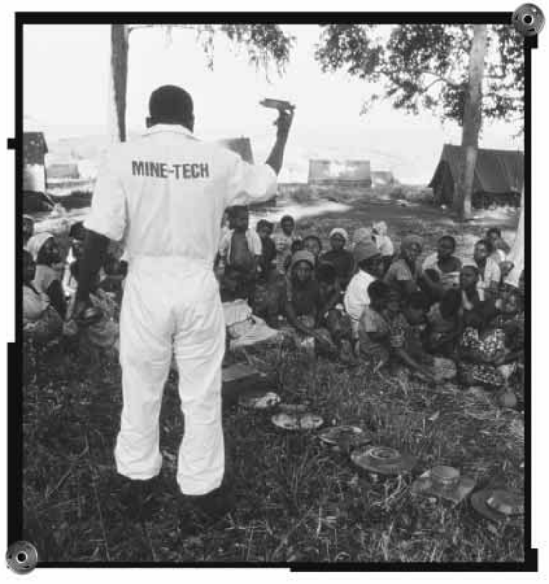
Returnees from Mozambique in a mine awareness class by a Zimbabwean Demining Company. Espungabera Transit Centre.