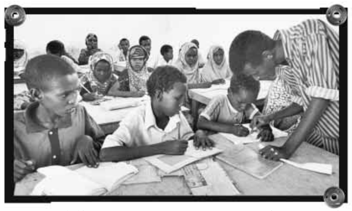
"Quick Impact Projects" (QIPs) funded under UNHCR's Cross-Border Operation include the rehabilitation of schools as well as "Food for Work" schemes and training for teachers. Bardera Camp, Gedo Region, Somalia.

Two approaches have been advocated to overcome this problem. One is to purchase additional supplies locally, to supplement standardized kits. (However, this presents problems if procurements need to go through a lengthy approval process.) Another is to develop separate kits for each grade and situation, as for grades 1 to 4 in Somalia (see above).