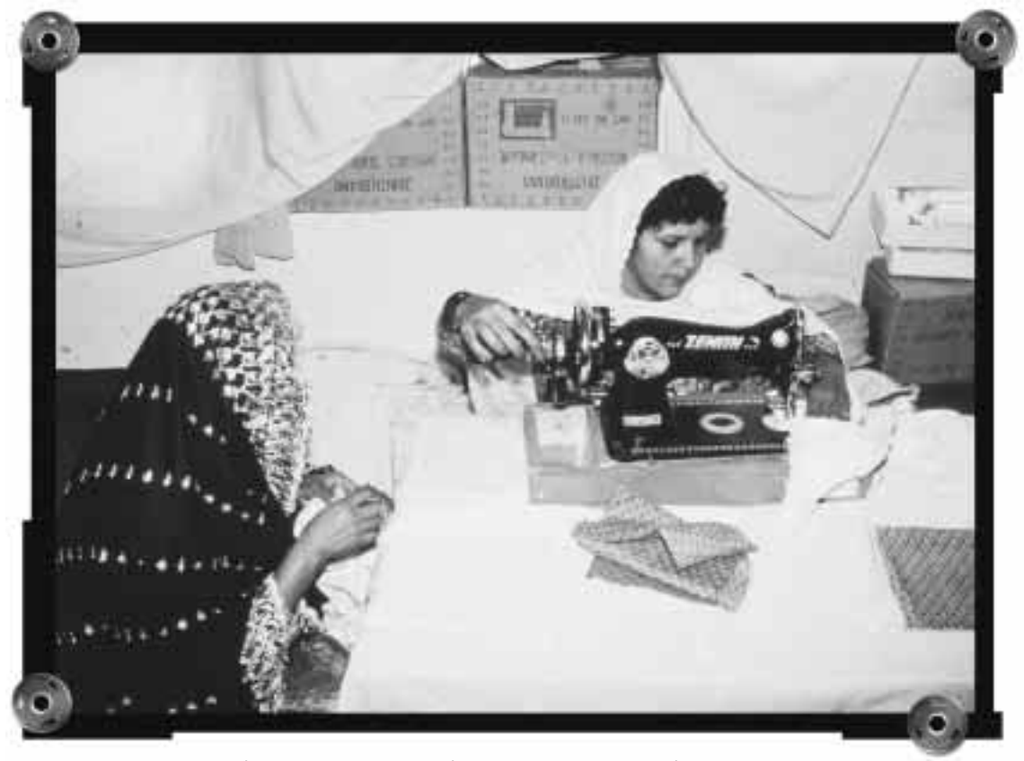
An income-generating project for women at the Kunduz Refugee Dpt., Kunduz Province, Afghanistan.

Attention to specific groups. Coverage for girls has increased dramatically since the mid-1990s, thanks to a range of measures and perhaps general social change, possibly the desire of educated young refugee men for literate wives. It was much helped by the decision of the World Food Programme to provide about 4 kg of edible oil per month to girls who attend school regularly. This helped to overcome the perception that it is pointless for Afghan girls to attend school, and too costly for poor families, in terms of requirements for decent clothing and so on. There is heavy drop-out of boys from poor families, since there is no restriction on participation in the labour market by Afghans; and the youngest boys earn money for their families by scavenging. As noted earlier, GTZ runs late-afternoon basic education classes for working boys. The Social Welfare Cell has promoted the participation of children with disability in non-formal or regular education activities.