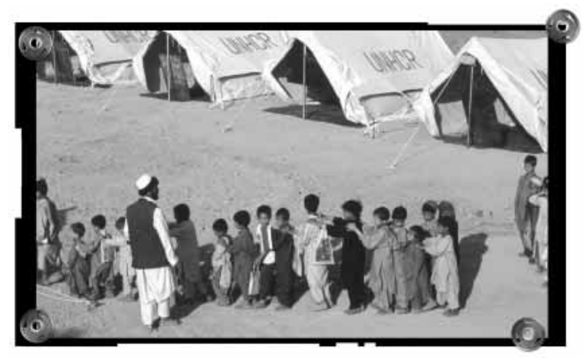
Refugee children line up in front of temporary school tents provided by UNHCR. Until school buildings can be constructed, UNHCR and its partners are providing basic education for refugee children at New Shamshatoo camp.

In many displaced populations, about one in three persons are in the age group for schooling and other child and adolescent activities. 12 Thus in the refugee populations recorded in the 1999 UNHCR Statistical Overview as "UNHCR-assisted" (UNHCR, 2000b: 3), totalling 6.9 million, there would be a total of about 2.3 million in the child and adolescent age group. This may be compared with the total of nearly 800,000 children and young people recorded as beneficiaries of UNHCR-funded education programmes, 13 to which must be added an unknown number who benefit from other assistance programmes or participate in schooling in the host country without special assistance. These very approximate statistics suggest that one-third of refugee children (excluding infants) and adolescents in populations categorized as "UNHCRassisted" are in UNHCR-supported schooling, 14 and that perhaps 40 per cent are in school altogether. Girls represent about 40 per cent of UNHCR-funded students (UNHCR, 2000a). These figures reflect the observation of the author and many colleagues that most children in UNHCR-assisted populations do