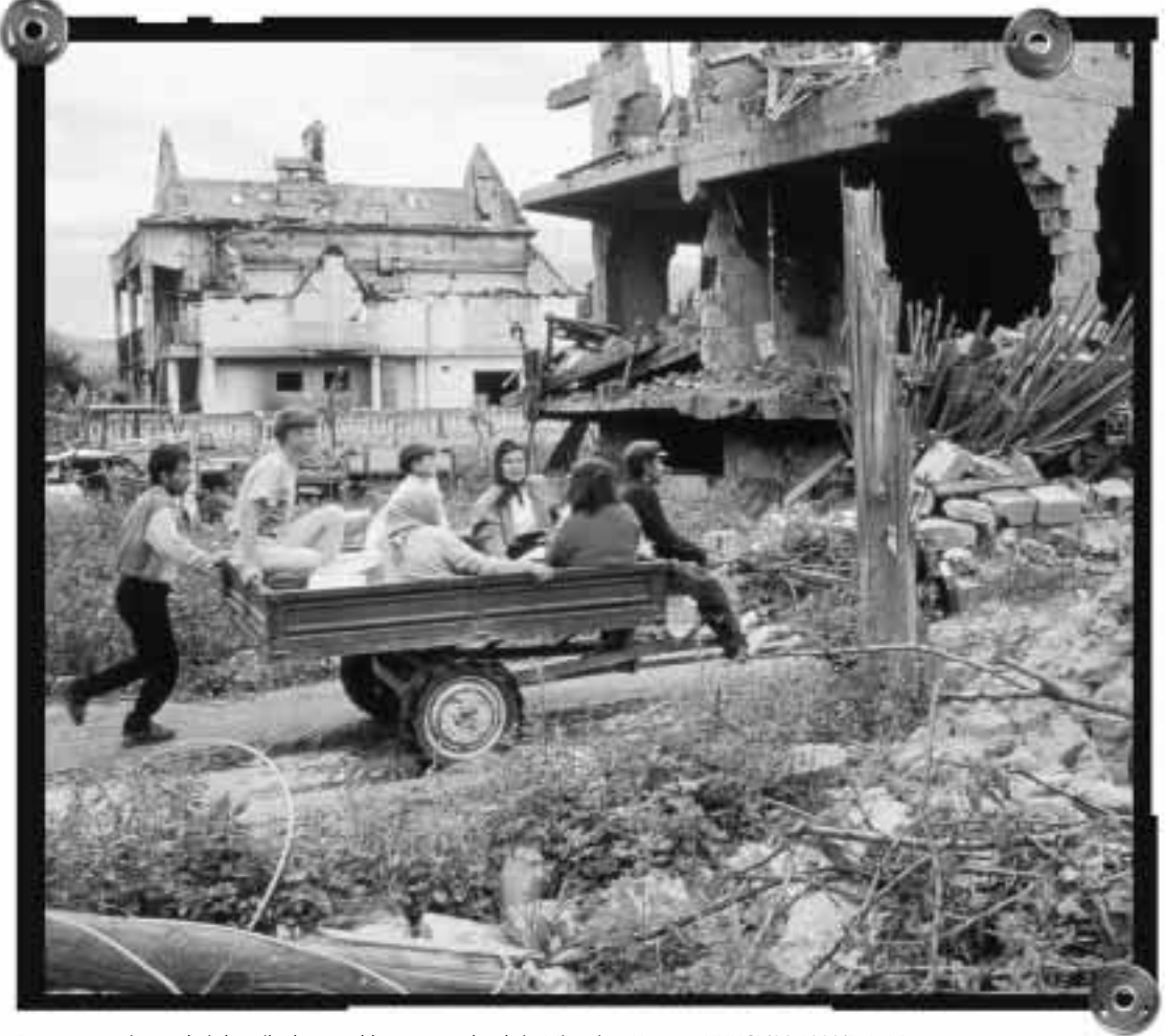
Returnees arrive at their heavily damaged homes or schools in Mitrovica, Kosovo.

In Macedonia, UNICEF served as the lead agency for education and achieved rapid education response. Secondment of five education specialists to UNICEF by the Norwegian Refugee Council enabled education response to begin in a matter of weeks. The NRC staff moved quickly, identifying and mobilizing teachers, space, tents and chairs.