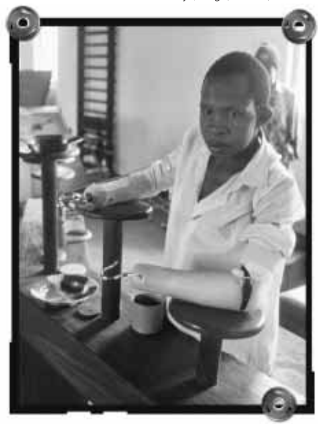
A mutilation victim receiving help at the National Pediatric Center in Conakry. UNHCR provides therapy and medical aid, including artificial limbs, to dozens of the victims who fled to Guinea from Liberia and Sierra Leone.