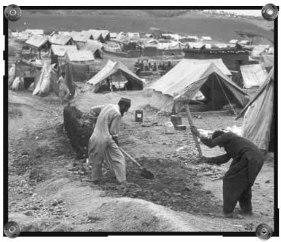
An estimated 170,000 Afghans have fled to Pakistan since September 2000, escaping both war and drought. The majority are housed at two large sites near the city of Peshawar, Shamshatoo and Jalozai. Refugees prepare pit latrines at the New Shamshatoo camp.

As mentioned earlier, new schools for urban refugees were established in and around Peshawar on a self-help basis during the 1990s; many were subsequently supported and absorbed by larger programmes. The Social Welfare Cell of the North West Frontier Province Commissionerate for Afghan Refugees still motivates newly arrived refugee communities, or those with a new interest in girls' education, to form "self-help" schools for the early classes of primary school, again with the need to link with larger programmes to have access to materials, teacher training and so on.