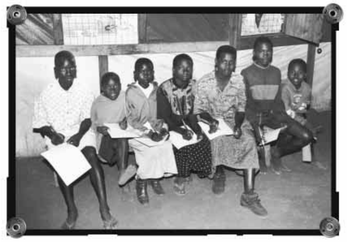
Peace education for refugees from Burundi and Rwanda, Ngara Camp, Tanzania.