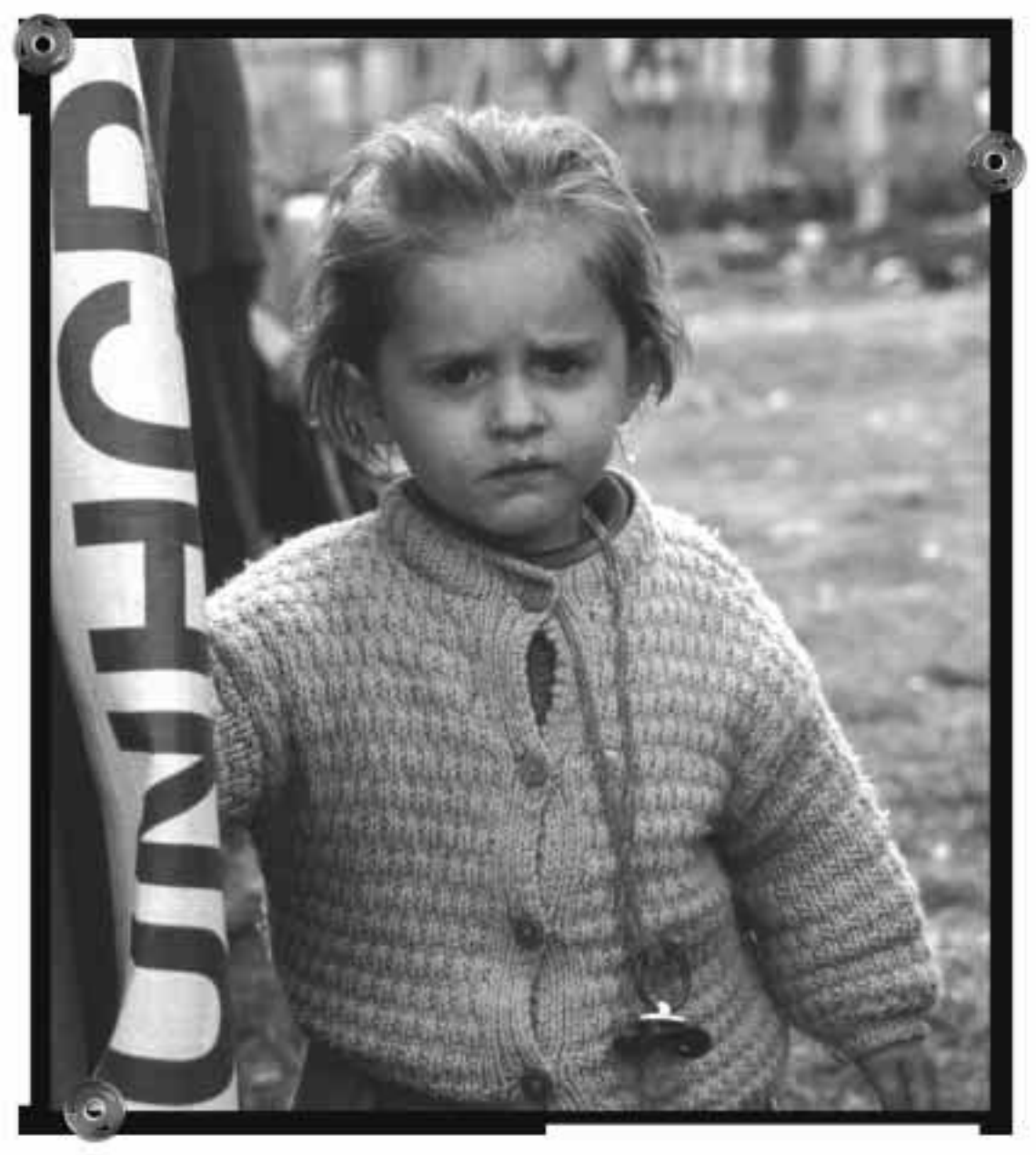
Many of the children are traumatized by the ordeal of their flight. This 3\frac{1}{2} year old girl and her family just arrived in Kukes, northern Albania, after an arduous five-day trek inside Kosovo.

Strengthening local education administration. In post-conflict situations, national- and district-level education authorities may be functioning with new staff and without basic office equipment or transport. Yet they may be asked to present strategies to donors and to coordinate the actions of UN agencies, NGOs and community groups. Training as well as modest material assistance should be envisaged in the early stages of reconstruction.