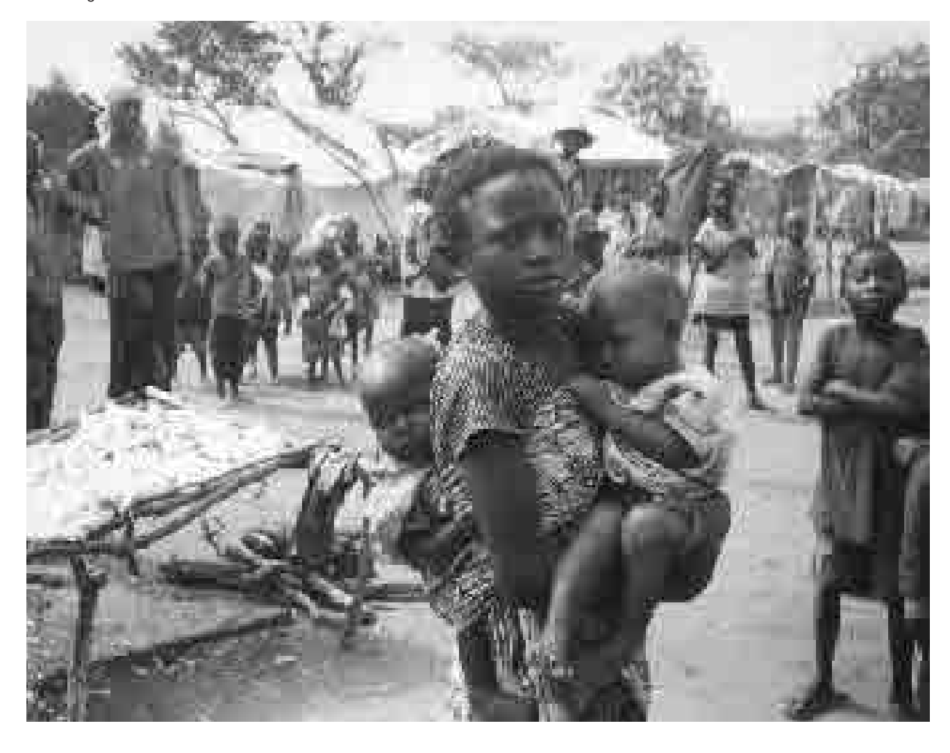
Refugee children often make up the majority of the camp population. Newly arrived Angolan refugees in the Ngidinga, Bas-Congo Province.

The continued poverty of the host communities coupled with the inadequate support and aid provided to the population at large continued to create disparity between the refugees and local people and made UNHCR's work difficult. UNHCR's limited resources did not allow balanced delivery of humanitarian assistance to both refugees and hosting communities, though efforts were made to diminish the disparity. Furthermore, limited funds