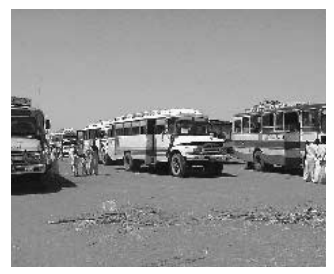
One of the continent's largest and oldest refugee communities began going home. Repatriation convoy from Sudan to Tesseney, Eritrea.

Education: 162 newly-trained teachers were made available to meet the teaching needs arising from the additional number of school-aged returnee children. Allowances were given to 600 secondary school students in Tesseney Town and four new classrooms were added to the primary school. 77 makeshift classrooms were also constructed in