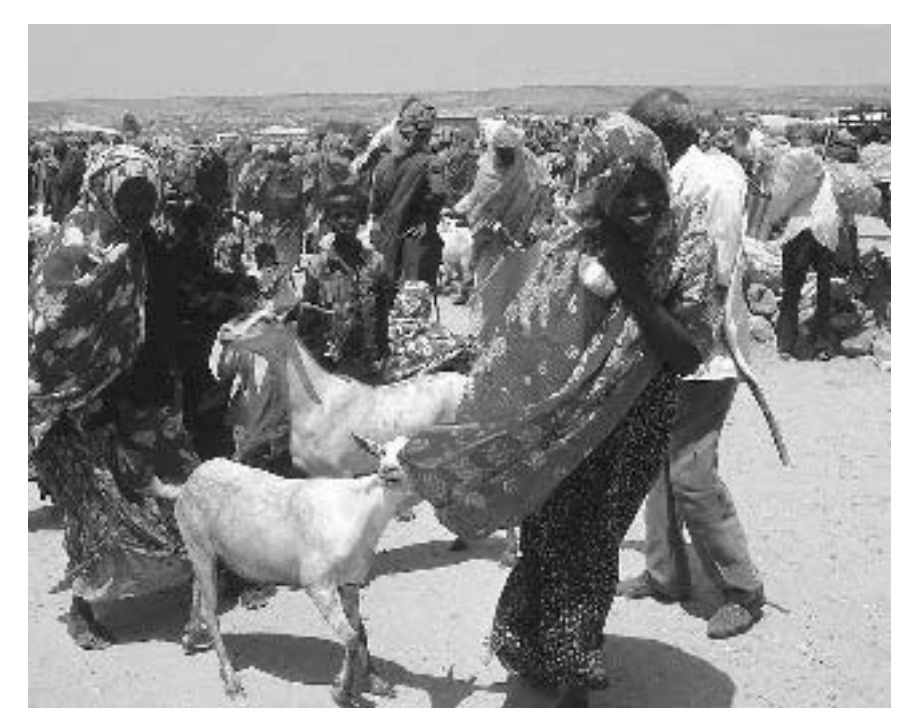
Small-scale trading is very much a part of the life of returnees in their communities. Here, they are seen at the livestock market in Hargeisa.

Income Generation: 750 female returnees in Hargeisa and Burao received loans of USD 150 for market trading, together with small business management and literacy training. Its benefits were subsequently reflected in the nutritional status of the beneficiary families.