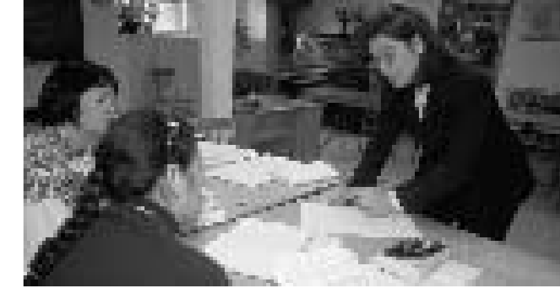
Canada: Refugees in a language class in Montreal.

In the Caribbean, depending on available funds and prioritisation on how best to reach its goals, UNHCR will work to establish new partnerships with State institutions and civil society at large to promote refugee protection. The Office will concentrate on ensuring access to asylum through train-