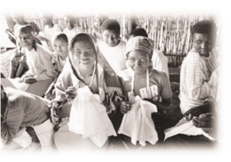
Sierra Leone: IDPs and Refugees from Guinea. Gender equity being promoted by the Forum for African Women Educationalist Girls Centre in Grafton, near Freetown.

In 2002, the Office will emphasise the importance of education from the very onset of an emergency, as an important tool for the protection of refugee children, including adolescents. An educational response during a refugee emergency requires readiness. This involves stand-by arrangements with key organisations, including the Norwegian Refugee Council and Save the Children, for the rapid deployment of experienced Education Officers. In 2000, the Inter-Agency Network for Education in Emergencies (INEE), an open network of UN agencies, NGOs, government partners, practitioners and researchers, was established to enhance co-operation in emergency education. INEE has been working towards defining guidelines and indicators acceptable to all parties, exploring the certification of refugee students and teachers and creating a range of learning materials for emergency education. UNHCR is part of the Steering Group and works within this framework.