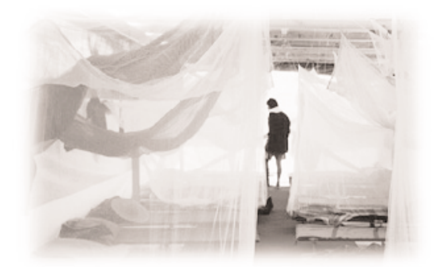
Nauru: Accomodation for asylum-seekers at the Topside site.

aimed at achieving durable solutions for refugees and asylumseekers, monitoring potential population displacements, providing support for emergency preparedness and capacity-building as well as undertaking promotion and advocacy activities through training and seminars. In Malaysia in particular, greater emphasis will be placed on public advocacy through networking with national institutions, civil society and NGOs. Activities will aim at promoting understanding of both refugee issues and protection principles. This is expected to generate both public and private sector support. A mechanism will be developed to increase UNHCR monitoring in selected areas outside Kuala Lumpur where most newly-arrived refugees and asylum-seekers are located.