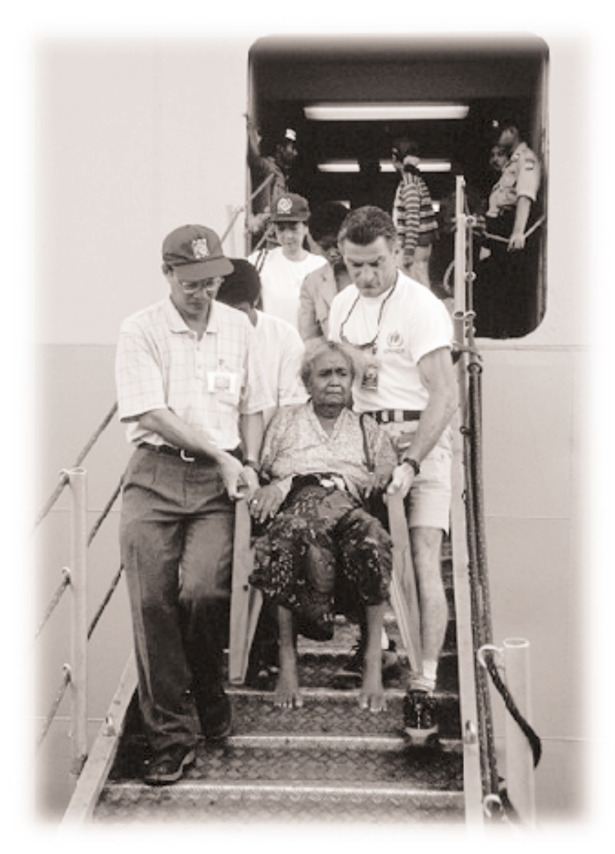
East Timor: East Timorese arriving in Dili.

the basis for UNHCR's continuing operational partnership with the Government in 2002 and beyond. UNHCR will also continue efforts to improve protection of and assistance to refugees and asylum-seekers in mainland China as well as in the Hong Kong Special Administrative Region, where the number of asylum-seekers of various origins other than Indo-Chinese, increased significantly during 2001. To this end, the Office will actively pursue the establishment and implementation of national legislation and procedures which comply with international protection standards.