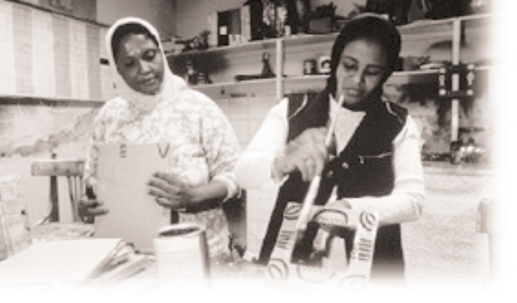
Egypt: Refugees from Yemen, Sudan and Ethiopia attend woodwork and crafts' classes.

interview or counsel women refugees and asylum-seekers. In addition to material assistance provided on a needs basis, UNHCR will offer vocational training to promote local integration, economic self-sufficiency (especially for female heads of family) as well as active representation of women on refugee committees and in all other aspects of community life.