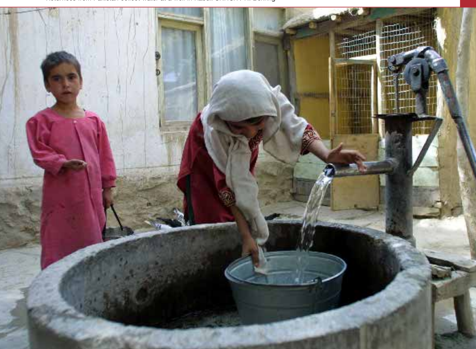
Returnees from Pakistan collect water at a well in Kabul.

Water: Work has been carried out on more than 2,600 wells, as well as on karezes (irrigation channels), piped water schemes and canals in returnee areas.