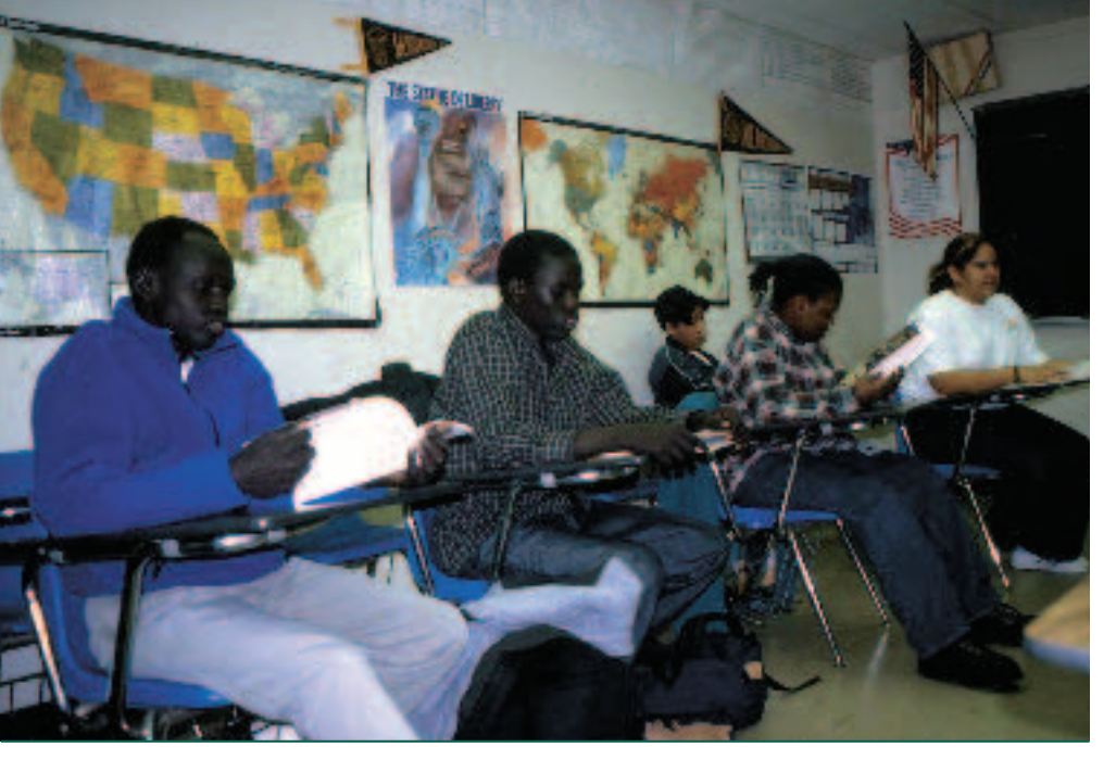
Resettled Sudanese refugees at Meadowbrook High School, Richmond, Virginia.

liaison officers in Barbados and Haiti. In addition, UNHCR conducted training sessions with government and civil society representatives throughout the region. These were consolidated at a regional protection conference held at the end of the year. As a result of the Office's efforts to promote the Caribbean countries' accession to the 1951 Convention and/or the 1967 Protocol, St. Kitts and Nevis acceded to the 1951 Convention in February 2002.