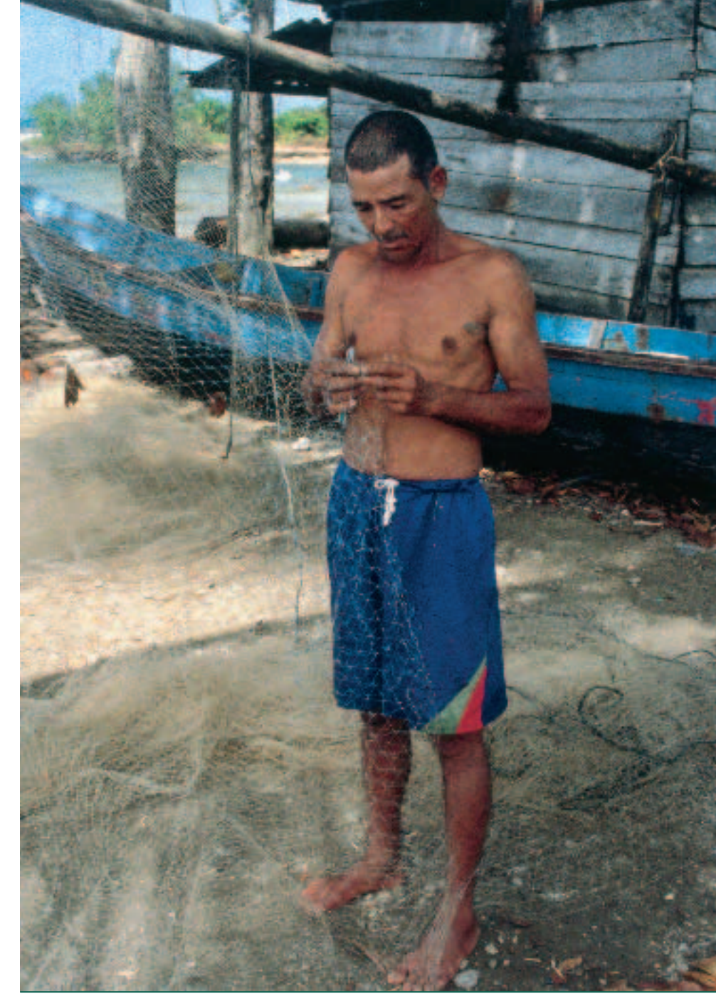
Panama: QIPs in Puerto Obaldin: Here a fisherman has received fishing material to help him to earn a living.

work. As a consequence, UNHCR focused its attention on ensuring the effective delivery of assistance to asylum-seekers. UNHCR carried out numerous missions to the area, from headquarters and UNHCR's office in Venezuela. Since September 2002, a protection officer was also deployed to Panama on a semi-permanent basis to address emerging protection problems in the country. In collaboration with implementing partners in the Province of Darién, UNHCR developed small-scale community-based projects, which will benefit both the local population and refugees. In December 2002, UNHCR approved the opening of new offices in Panama City and Yaviza (Darién Province). These are expected to become operational in 2003.