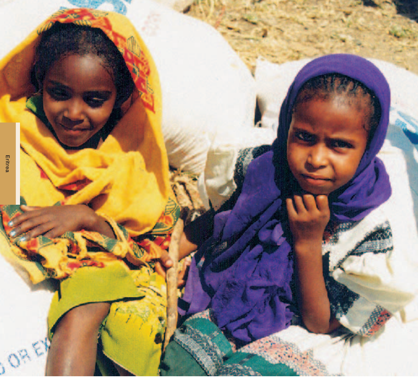
Until returnees can sustain themselves, food is distributed to newly arrived returnees.

medically vulnerable cases. Education of young girls and women will be promoted to combat the traditional practices of early marriages prevailing among the refugee population. Married and pregnant women will be encouraged to remain in school and enrolment of school-age girls will be promoted through girl's education committees. Refugee women will be supported to work out a strategy to address issues related to sexual and gender-based violence. Refugee women will also be encouraged to participate in all decision-making bodies in the camps, especially in food distribution. Sanitary materials will be provided to teenage girls and women. Separated refugee children will be identified, provided with appropriate protection and care, and assisted to trace their family members. Attention will be provided to refugees with special needs, including older refugees.