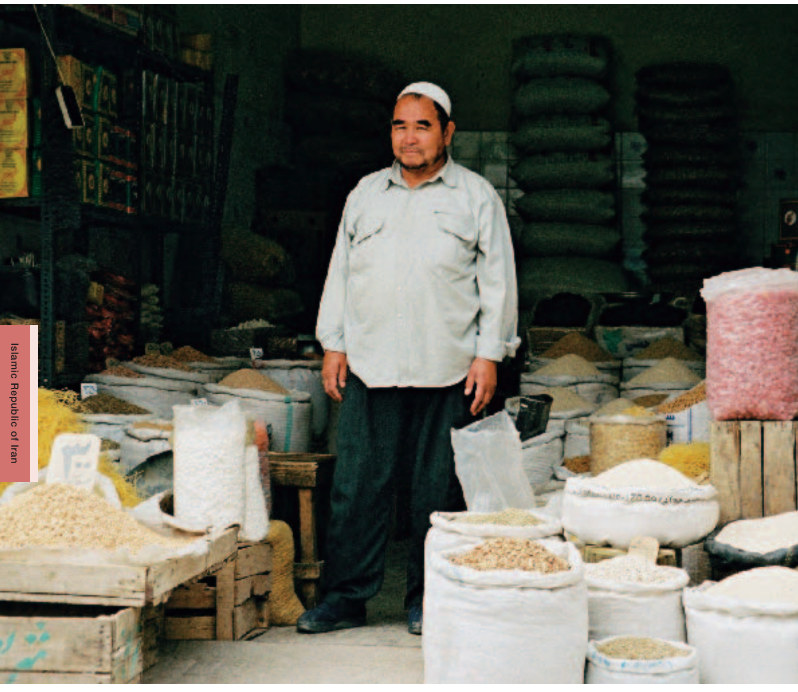
A refugee merchant selling dry goods at Gulshahr bazaar, Mashhad.

works with 189 staff (24 international, including one JPO, and 165 national).