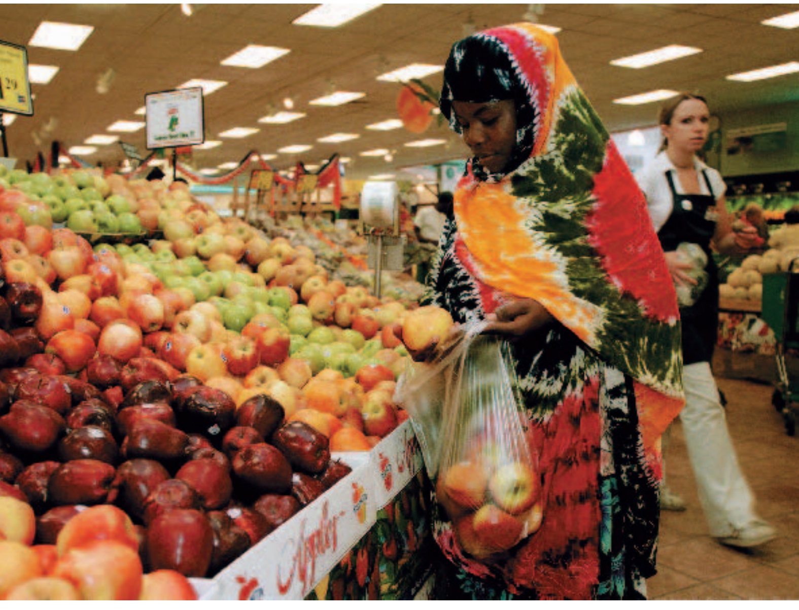
USA: From Africa to USA - a resettled Somali Bantu buying fruits at the supermarket - adjusting to a new way of life.

programmes to ensure that they respond to the needs of refugees for protection and durable solutions; building public and governmental support for refugees and UNHCR worldwide; and promoting and facilitating sustained financial support for UNHCR's operations.