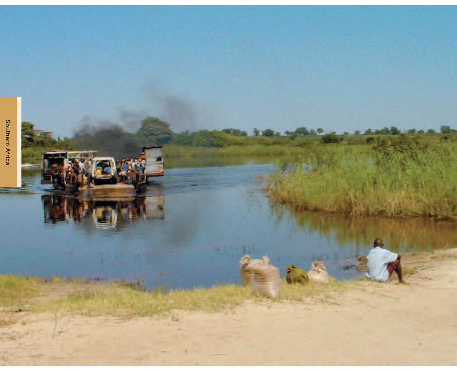
Zambia: Barges are the typical mode of transportation on the Zambesi river.

Emergency responses to new refugee influxes will be undertaken in collaboration with governments, NGOs, and other partners. Furthermore, UNHCR will strenuously pursue self-reliance and local integration opportunities for refugees with no prospect of alternative durable solutions and programme implementation will be geared towards exit strategies. The local capacity of governments and NGOs will be strengthened, and refugees will be trained and provided with resources as a step towards UNHCR's planned handover of some operations by the end of 2005.