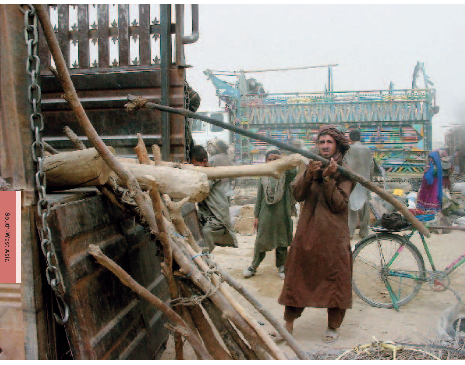
Pakistan: Afghan refugees in the Chaman waiting area preparing to go back home.

Offices in the Islamic Republic of Iran and Pakistan will continue to provide some basic services to refugees in camps and settlements, making sure that the assistance reaches the most vulnerable.