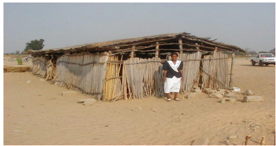
A thatched school in Senanga District (Senanga School for Orphans) before intervention of the ZI. Opposite-bricks for construction