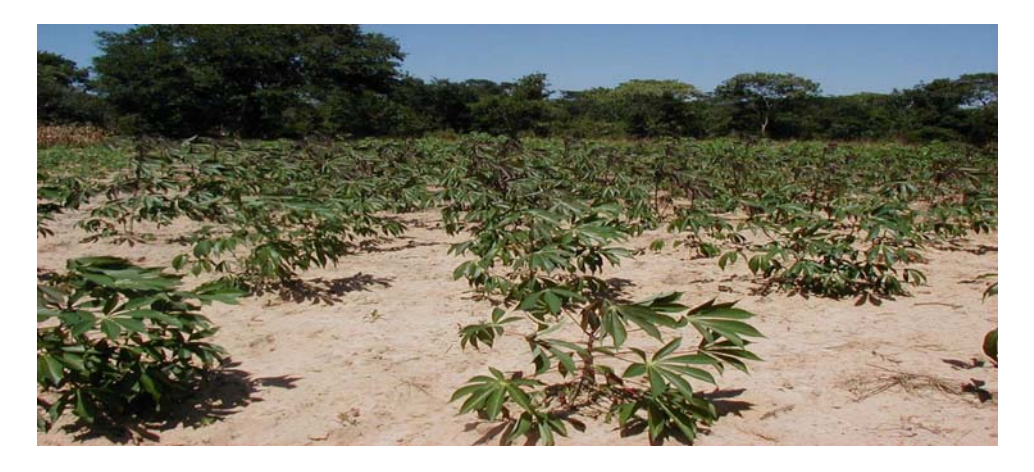
Cassava Demonstration plot in Mayukwayukwa, chief Mufaya area. ZI project introducing new varieties of cassava cuttings that mature early.