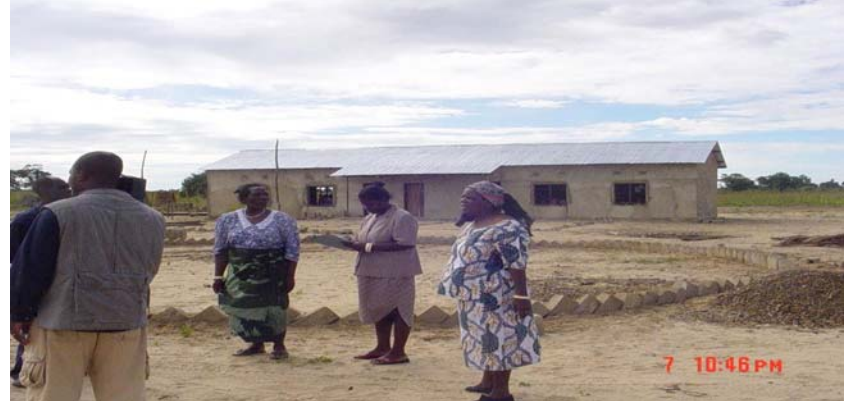
Above, is a 1x3 Classroom block Building has been completed at the orphanage centre, awaiting finishes like fixing window panes and painting. The classroom is already in use. The project is funded under a US contribution.

The orphan day care centre in senanga has recorded tremendous progress in terms of construction of a 1 by 3 classroom block. The project now is earmarking the construction of another 1 by 2 classroom block plus ten VIP toilets and a kitchen. Because of the rehabilitation and construction of concrete structures, the school enrolment of orphans and vulnerable children including refugees has now doubled.