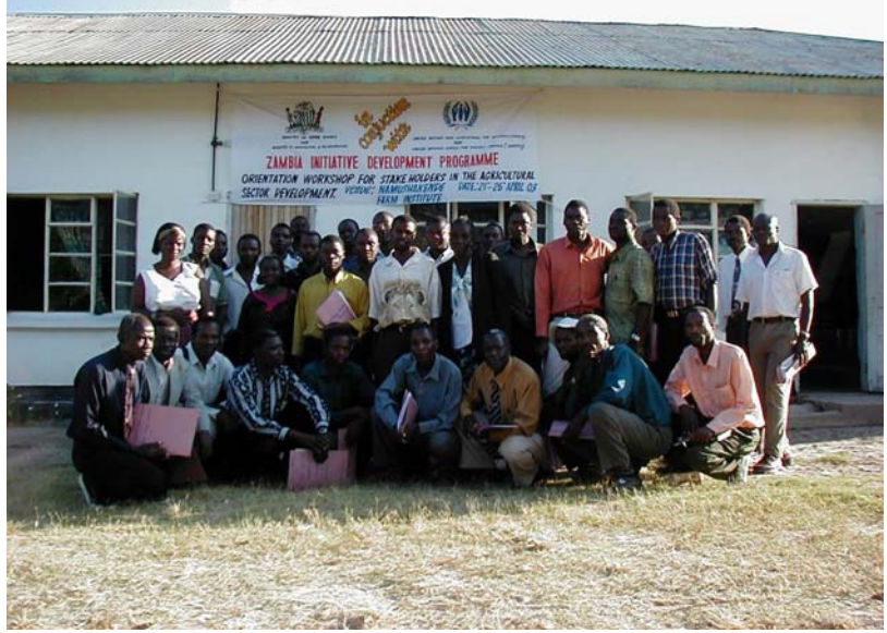
The picture shows a group photo of LDCs and GRZ agric. Camp Extension officers during the Orientation workshop for agriculture development stakeholders conducted in Mongu, at Namushakende farm institute in April 2003.

Some LDCs registered as co-operative societies received training in readiness of introduction of a community managed rural credit scheme and revolving fund. The project is funded under US contribution. In the context of capacity building, three District Agricultural Officers were sent on Agricultural Development training in Japan. This was done in October to December 2002 under the sponsorship of JICA. A series of workshops have been planned to ensure LDCs are trained and able to manage and implement the project at the grassroots.