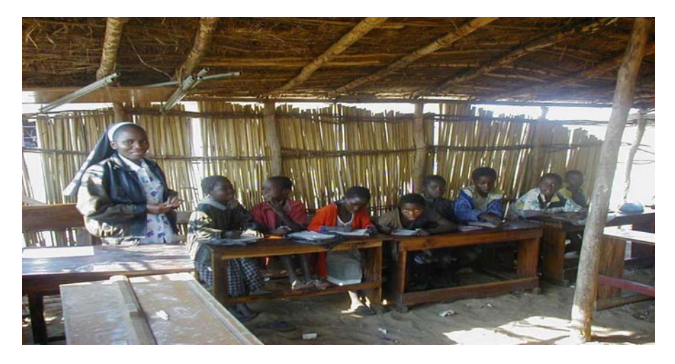
Pupils at the Orphanage centre, in the Senanga District in grass thatched classroom (before the implementation of the ZI).

the target communities composing of 50% refugee participation where there is high concentration of refugees and 25% participation in target areas were the refugee presence is not high. The tasks of these LDCs are to identify, implement and manage projects. Each LDC covers some 6-10 villages comprising of elected village representatives, including traditional leaders.