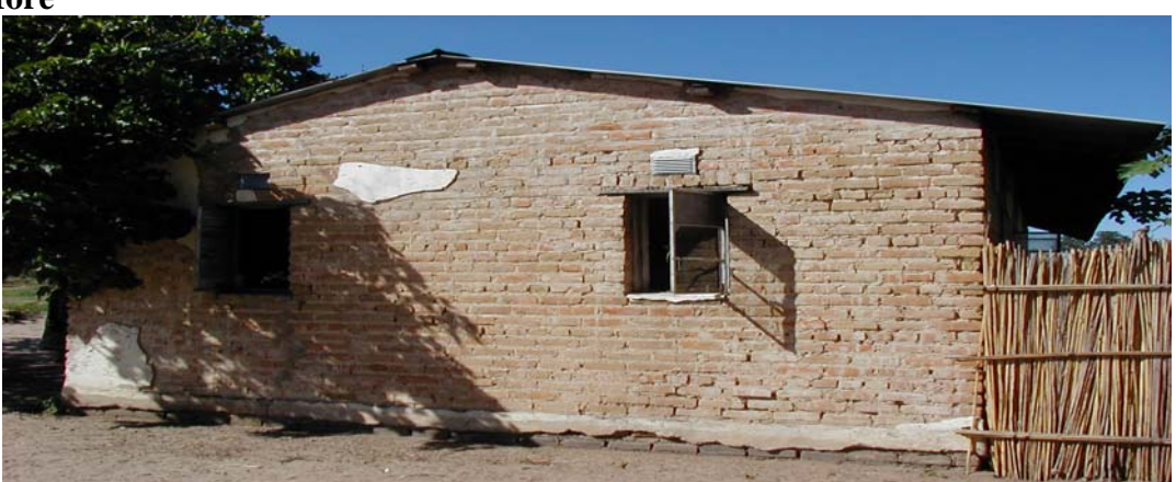
A teacher's house in Ngundi in a deplorable state, before Zambia Initiative intervention.

The ZI program has been engaging LDC's and local villagers/refugees in moulding clay bricks used for construction of schools and health centres.