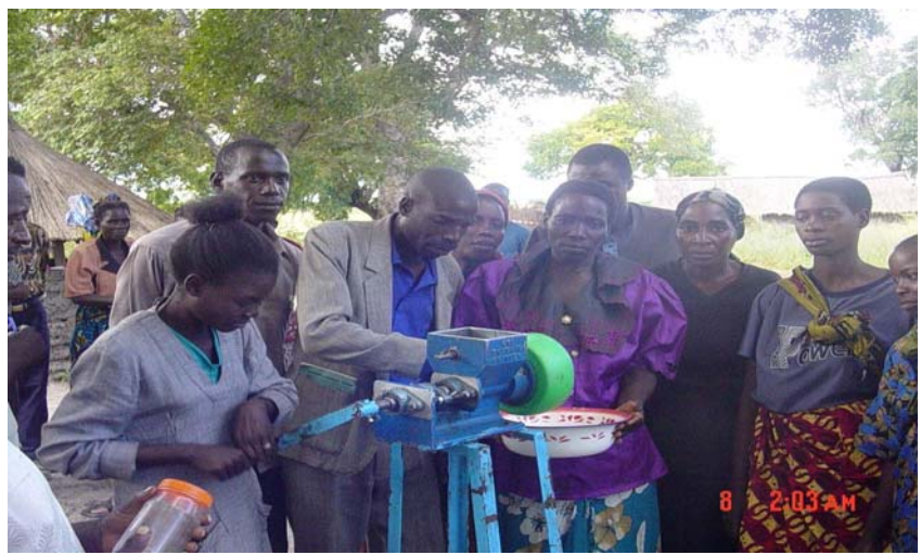
Members of the LDC in Lui-Wanyau in Senanga District demonstrating on how to use a hand-oil-making machine. The machine is used for peanut butter processing and also for extracting cooking oil.

The ZI has also embarked on dairy processing using simple traditional techniques. Above is an Agriculture Officer providing training to local farmers in Lui-Wanyau in Senanga on how to process cheese and other dairy products.