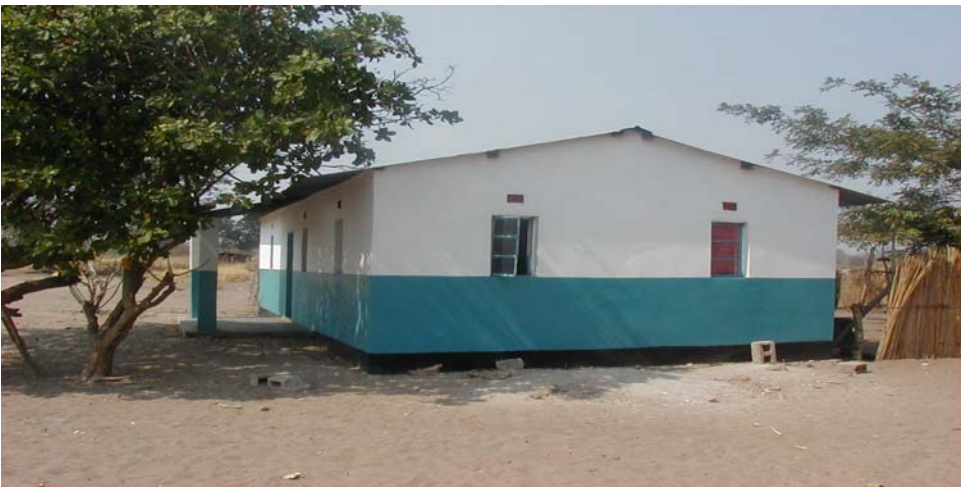
The rehabilitated teacher's house at Ngundi Basic School in Senanga district. This is a Danish funded project.