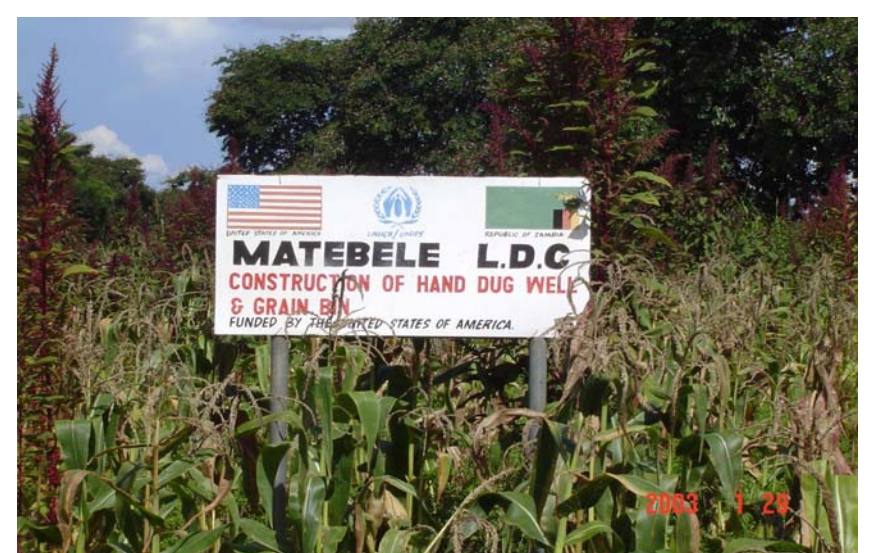
Food security has also been promoted by encouraging LDCs to practice winter croping in the dambos.