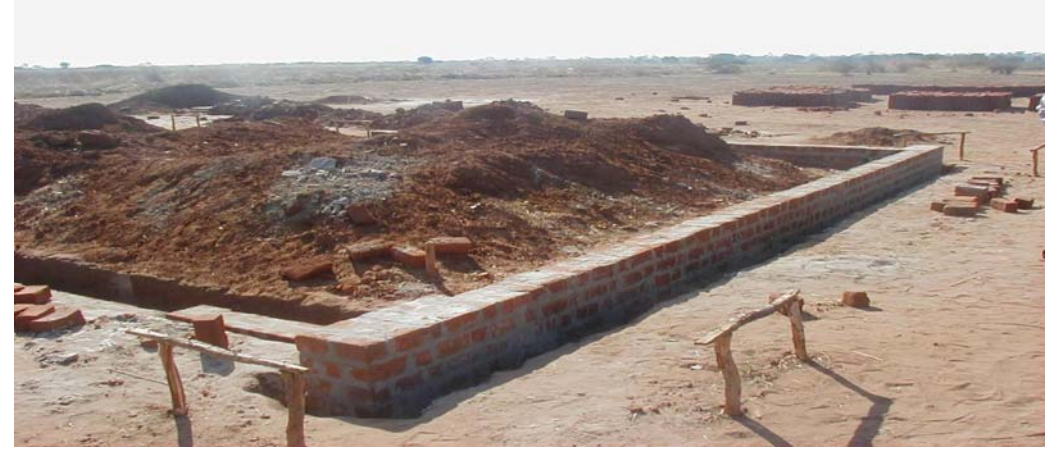
Construction of the YWCA Reproductive Health Training Centre

The construction is at slab level. The project is funded under Swedish small grant contribution.