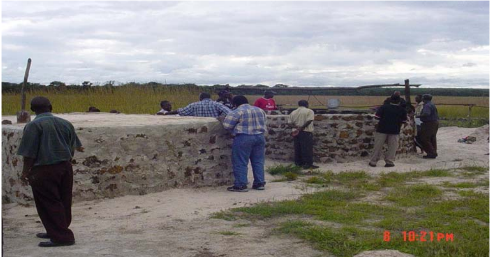
Construction of Communal Hand-dug wells

The picture above shows one of the demonstration hand dug wells under construction in one of the fields in Nkenga, plus an embankment raised for construction of a reservoir on top.