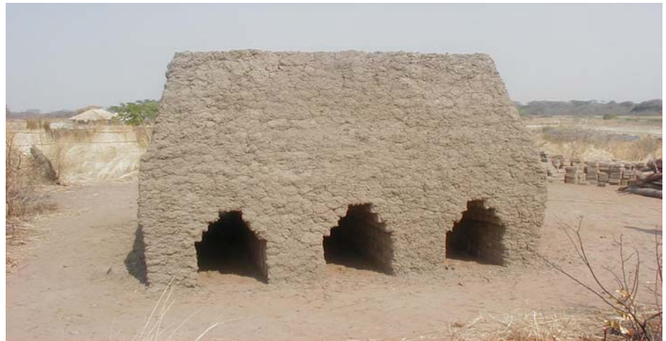
Above is a Kiln prepared in readiness for buring of bricks in Mayukwayukwa.

The ZI program has been engaging LDC's and local villagers/refugees in moulding clay bricks used for construction of schools and health centres.