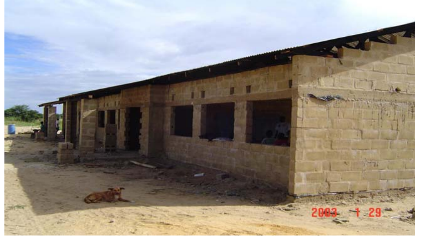
A 1 by 3 classroom block under construction at Senanga Orphan day care centre.