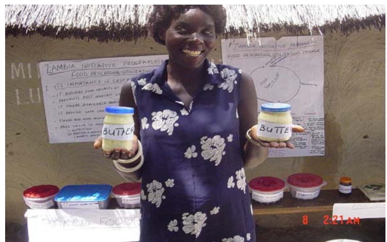
Above, a Zambian woman displaying some of the food products (Butter) produced under the income generation programme at Lui-Wanyau in Senanga District