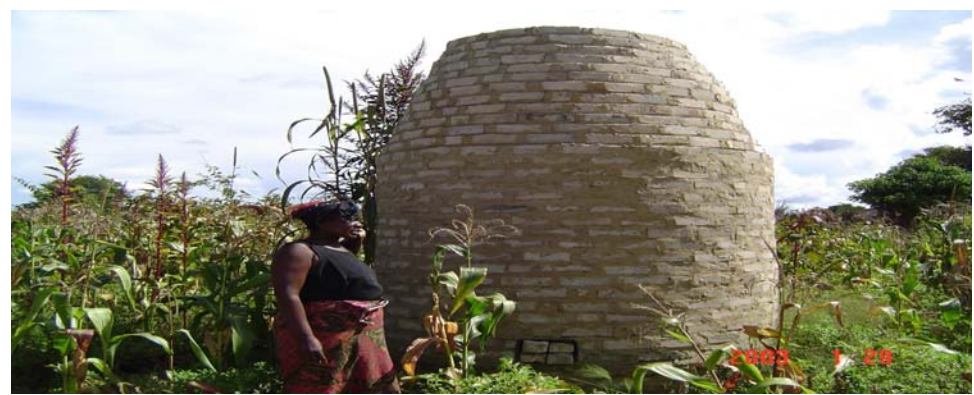
A member of the host community in Matebele LDC explaining how a demonstration storage silo will benefit her community.

(Kaoma) and another 4-grain bins have also been made in Matebele, Namaenya, Ngundi and Kalongola in Senanga & Shangombo districts respectively. The Silos are able to store 25-30x90kg bags of Maize each). The project is funded under US contribution.