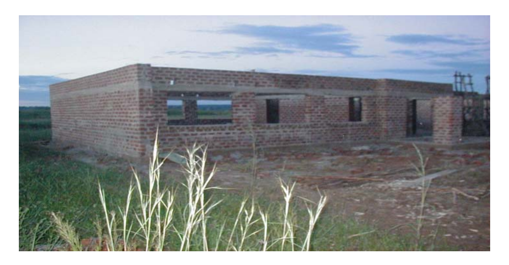
Construction of the 1 by 3 classroom block at Mayukwayukwa high school under construction, and the building is at roof level.