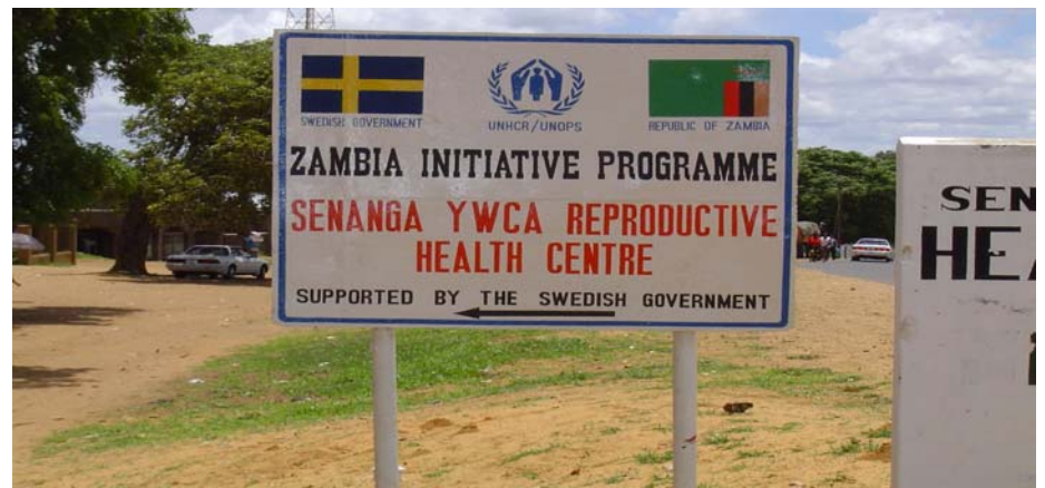
Above, is a sign post at the site where the centre is under construction. Once completed, it will assist in providing skills training in various vocations, including handling reproductive health counselling issues.