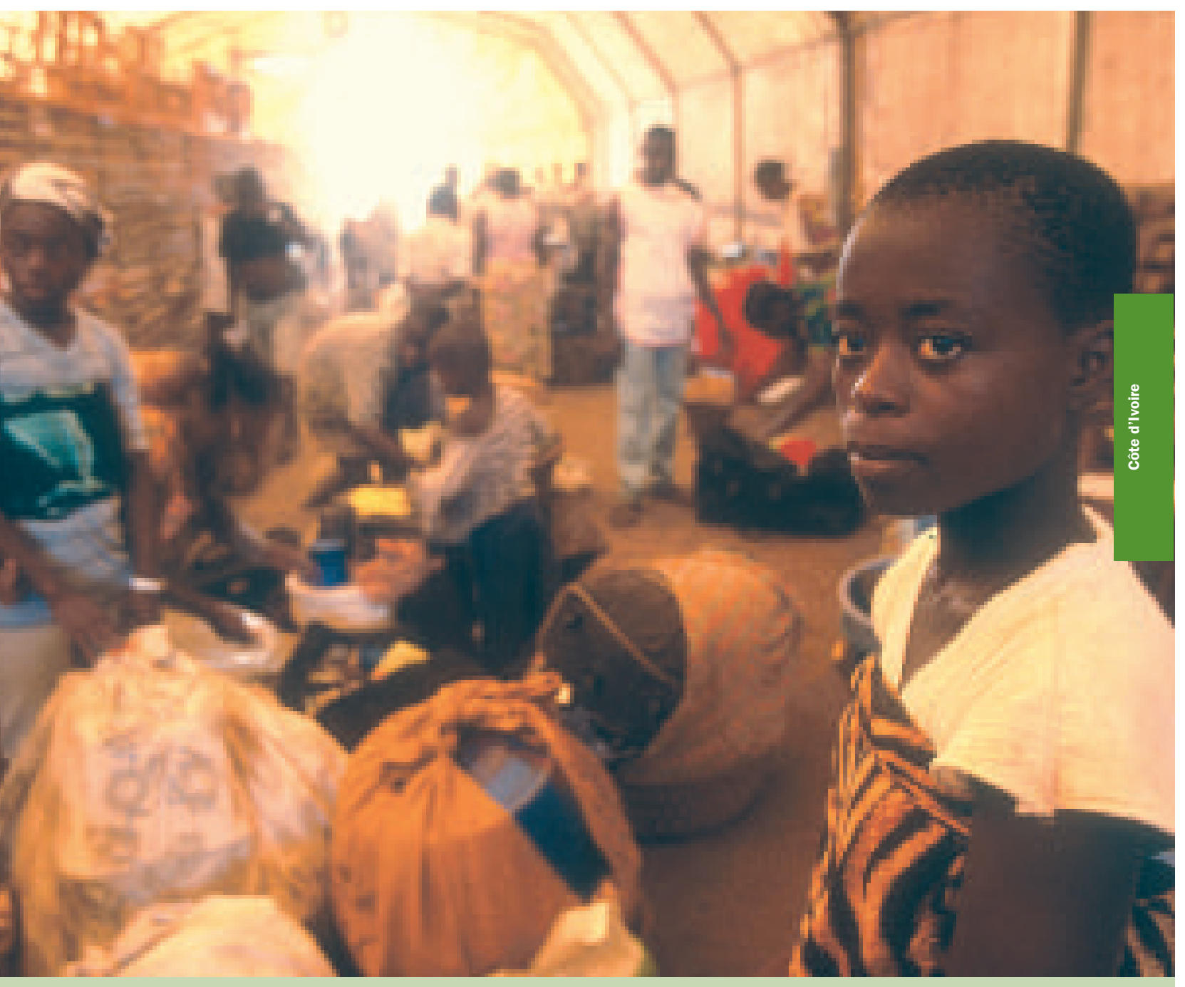
Liberian refugees at a transit camp in the Tabou area waiting for transportation to go home.

Therefore, 57 wells and 191 latrines were rehabilitated or constructed, benefiting 26,253 refugees and 8,950 local residents. Water and sanitation committees were established to manage the infrastructure and educate the end-users.