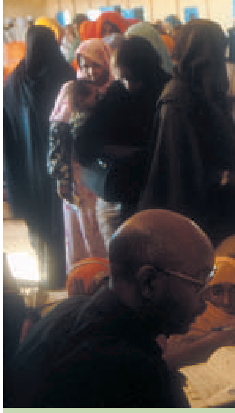
To facilitate their reintegration, returnees are registered for ID cards in Tesseney.

New arrivals from Somalia and Sudan were granted prima facie refugee status and accommodated in Emkulu and Elit refugee camps respectively. Protection activities included increased monitoring in both camps, installation of a new registration system and improvements to the standard of services and safety in cooperation with the Government. Voluntary repatriation was not a viable option for Somali or Sudanese refugees during 2003. Most refugees stayed in camps as local integration was not possible. The Office continued to engage the Eritrean