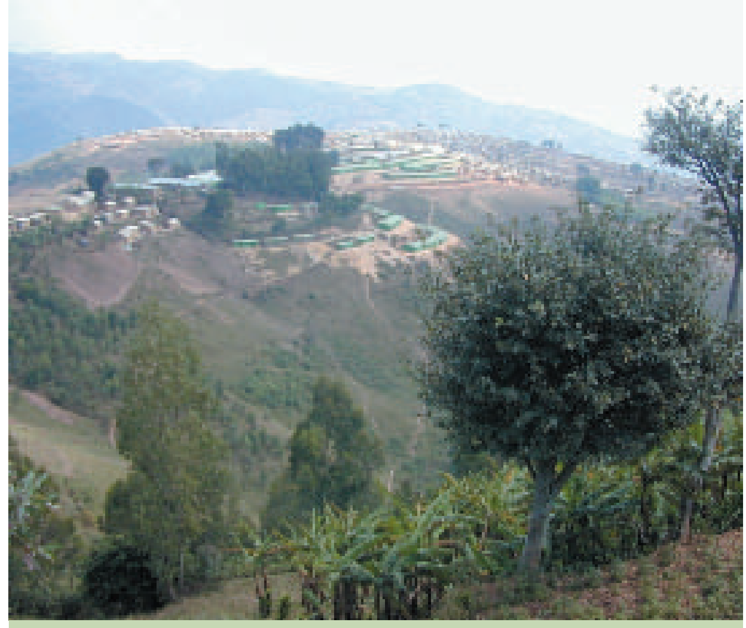
For over 10 years, Rwanda has been home to some 15,000 Congolese refugees. Here, the Kiziba refugee camp near Kibuye is shown.

acknowledged that Rwandan society had transformed itself since the traumatic experiences of 1994. In this context, UNHCR decided that it was safe for the majority of Rwandan refugees to return to their country of origin and it consolidated its plans to actively promote the repatriation of Rwandan refugees.