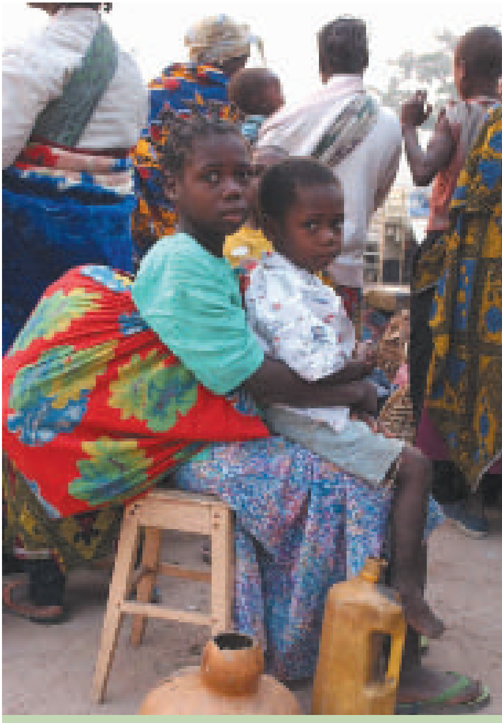
Angola: Returning to their homes is the ultimate goal for most refugees but it is both a euphoric and frightening experience. Amongst those preparing for a return trip are these DRC Congolese with all their belongings.

A tripartite agreement was concluded between UNHCR and the Governments of Mozambique and Rwanda for the enhanced repatriation of Rwandan refugees.