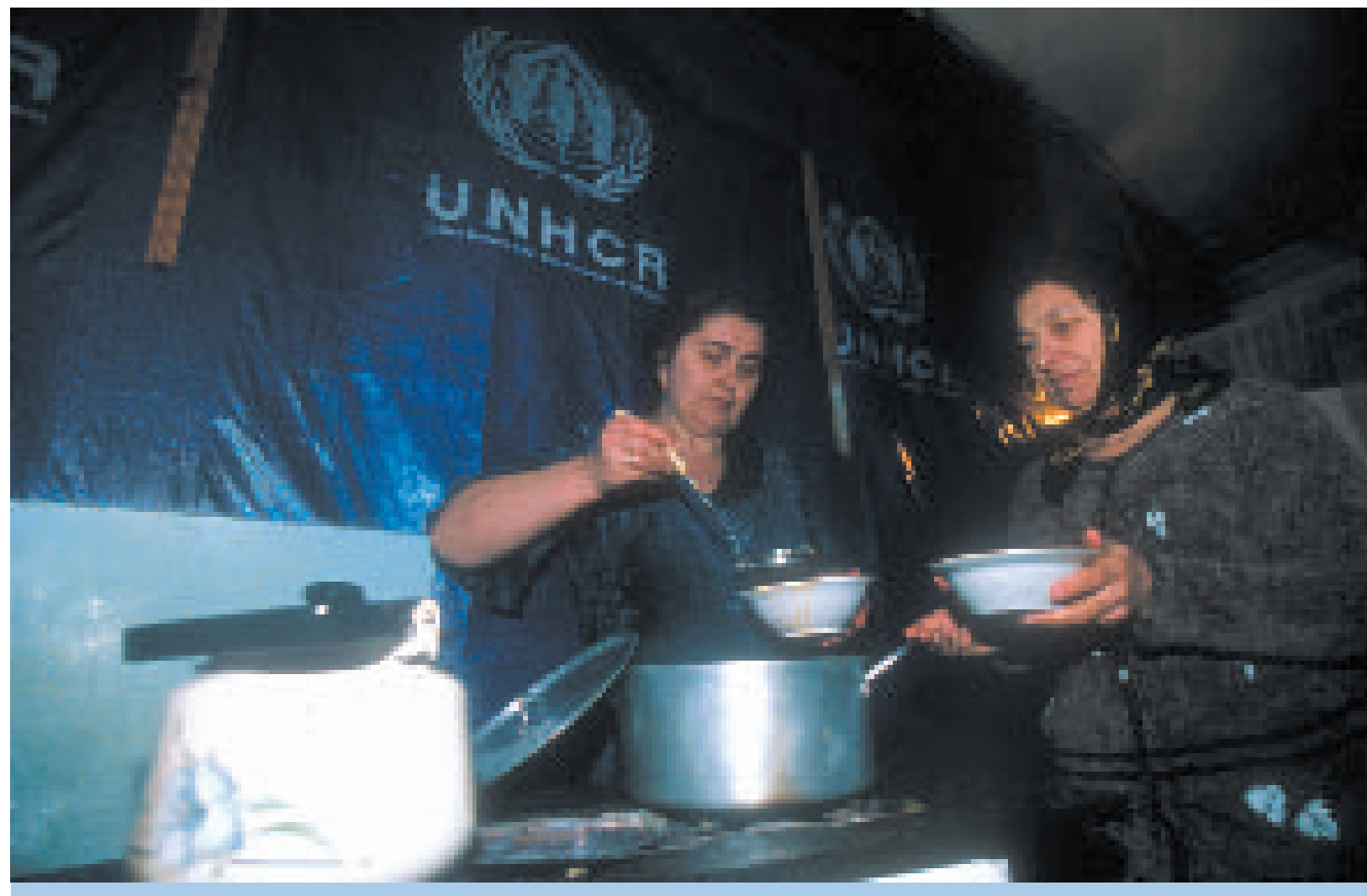
Inghushetia: Chechen IDPs receiving food in a settlement in the Sunzhenski district.

Progress was made with regard to the de facto stateless Baku Armenians in Moscow. In contrast, however, the situation in Krasnodar remained unfavourable for the Meskhetians. UNHCR continued to pursue integration, including access to citizenship. In the case of the Meskhetians, repatriation may also be an option, should Georgia fulfil its earlier commitment to the Council of Europe. The US Government complemented the programme by offering resettlement opportunities to both groups.