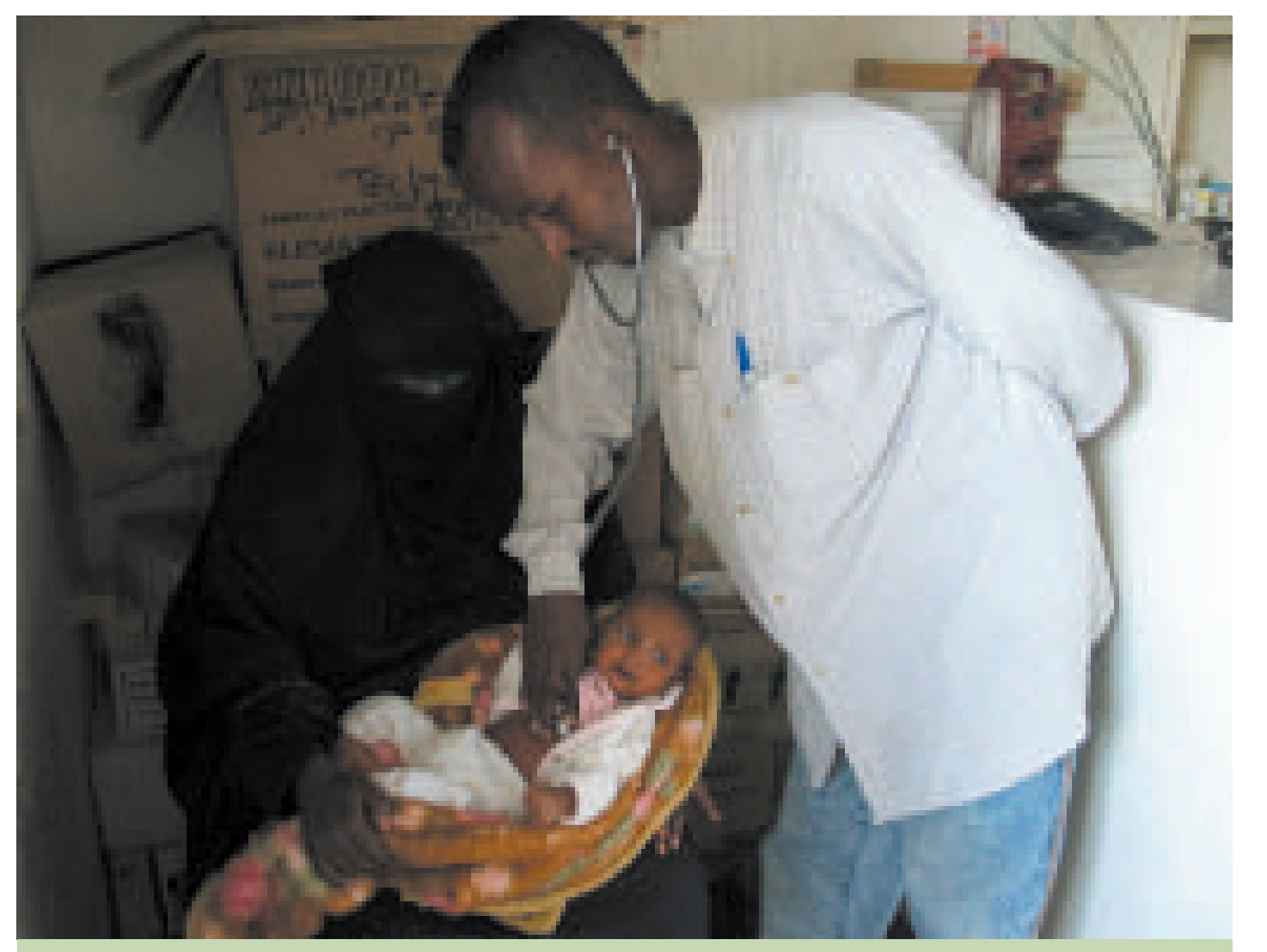
A young pharmacist in Galkayo, who returned to Puntland after eight years in a refugee camp in Kenya, examining a dehydrated baby boy brought in to the pharmacy by the baby's mother.

most returnees from Djibouti and Ethiopia, and workshops were conducted for farmers on sound agricultural techniques. In addition, a total of 5,500 individuals benefited from the distribution of tools and seeds for vegetable gardens and cereal production.