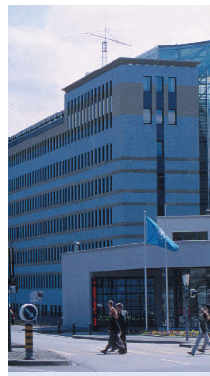
UNHCR's Headquarters in Geneva.

Political Affairs (DPA) and Peacekeeping Operations (DPKO) in particular has served to highlight the critical link between forced population displacement and international peace and security. The safety of returning refugees and displaced persons is being