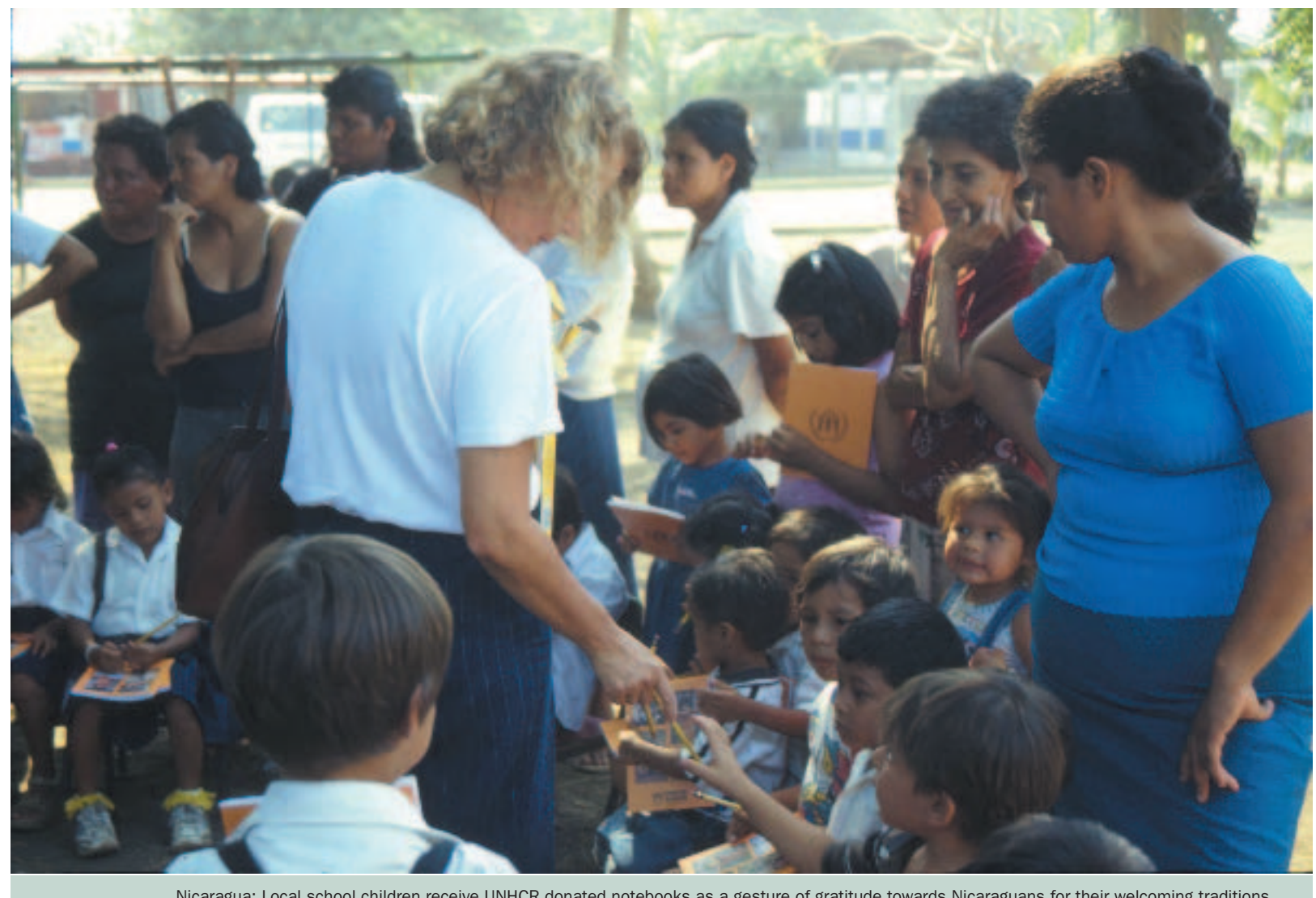
Nicaragua: Local school children receive UNHCR donated notebooks as a gesture of gratitude towards Nicaraguans for their welcoming traditions.

legislative framework for refugee protection. UNHCR's capacity-building and legal advisory support had a clear impact on the Government's capacity to make decisions on asylum claims according to international standards and in providing assistance to urban refugees and asylum-seekers on RSD procedures. The Office trained migration, border, police, military and municipal officials, as well as NGOs on refugee law, to further improve their capacity to identify asylum-seekers in mixed migration flows, especially at the southern border at Tapachula. With the conclusion of the transfer of land ownership under the Trust fund to the State of Quintana Roo for long-staying Guatemalan refugees, UNHCR ended its direct involvement in the process. By the end of 2004, some 4,320 Guatemalan refugee families in Campeche and Quintana Roo received individual land titles.