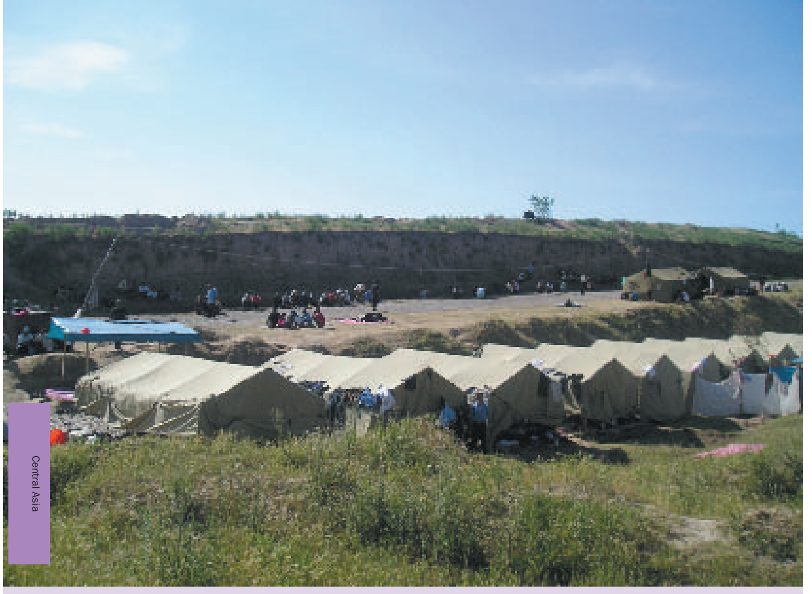
Kyrgyzstan: Uzbek refugees in Barash camp, shortly before their departure for Romania, from where they would be resettled to other countries.

the integration of refugees, including the granting of citizenship or residence rights. Preparatory work for the implementation of the cessation clause is underway to ensure that meaningful solutions for Tajik refugees in neighbouring countries (as well as returnees) will be attained, and that any remaining protection needs of Tajiks can be identified. The Office will continue to support the voluntary repatriation of Afghans and other refugee groups in the region with the strategic use of resettlement as a durable solution for applicable cases.