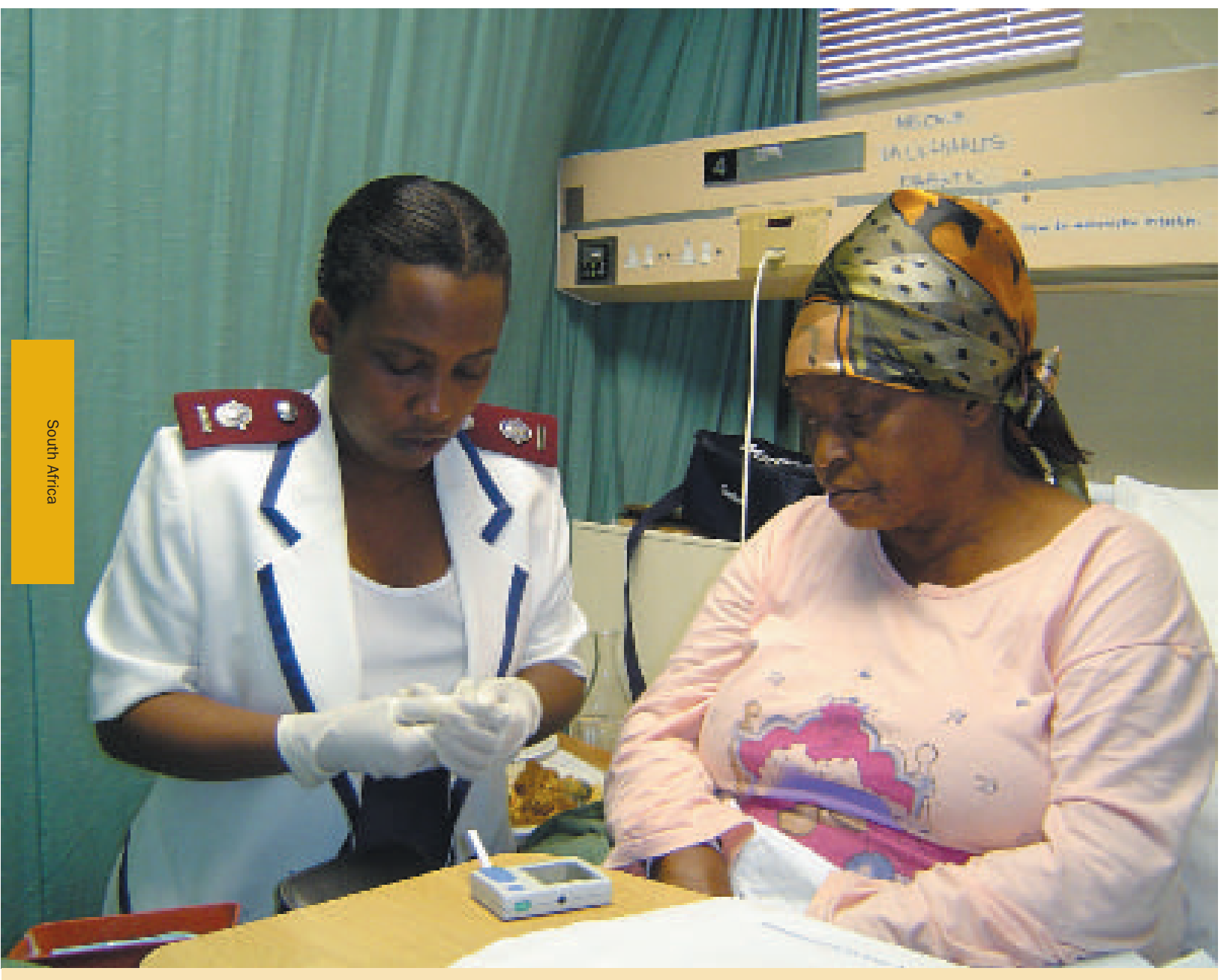
A Rwandan refugee who worked as a guard in Durban for several years and was awarded a DAFI scholarship to study medicine. She passed her exams suma cum laude and is now working as a "Sister" at Durban City Hospital.

officers. With the development of a DHA refugee database, the Office will work closely with the statistician newly appointed by DHA to ensure a clear and consistent approach to refugee and asylum-seeker statistics.