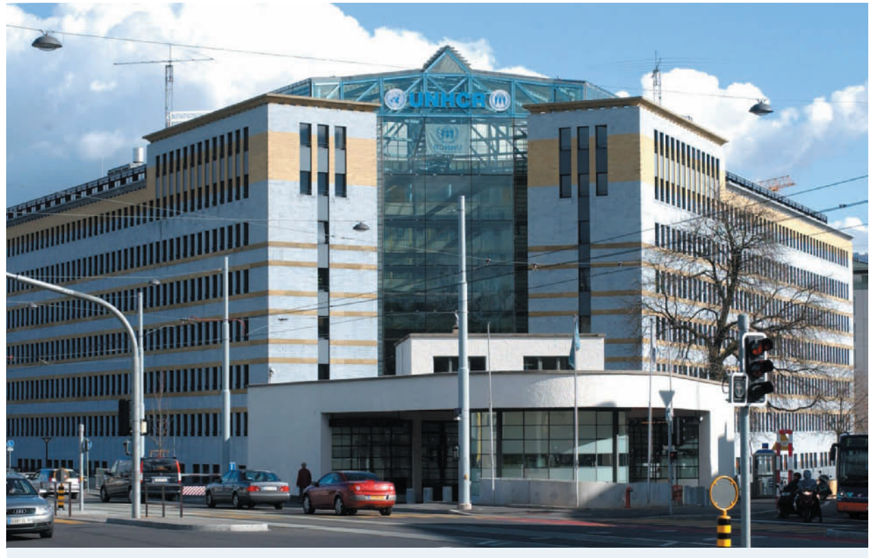
UNHCR Headquarters in Geneva.

At the 56<sup>th</sup> session of the Executive Committee, the High Commissioner sought and received approval for the creation of the post of Assistant High Commissioner for Protection in addition to the existing Assistant High Commissioner, whose position was renamed Assistant High Commissioner for Operations. The move, together