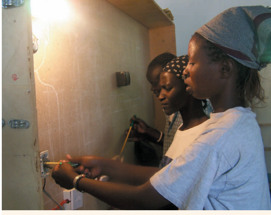
In Kakuma camp, refugees are trained in a wide range of professions, including as electricians.

In urban centres, over 8,500 consultations were provided by an implementing partner. Treatment was given for upper respiratory tract infections, diarrhoea, skin diseases and gynaecological conditions. For more complicated cases, patients were referred to hospitals. Collaboration with the Ministry of Health was strengthened, as findings from the participatory assessment