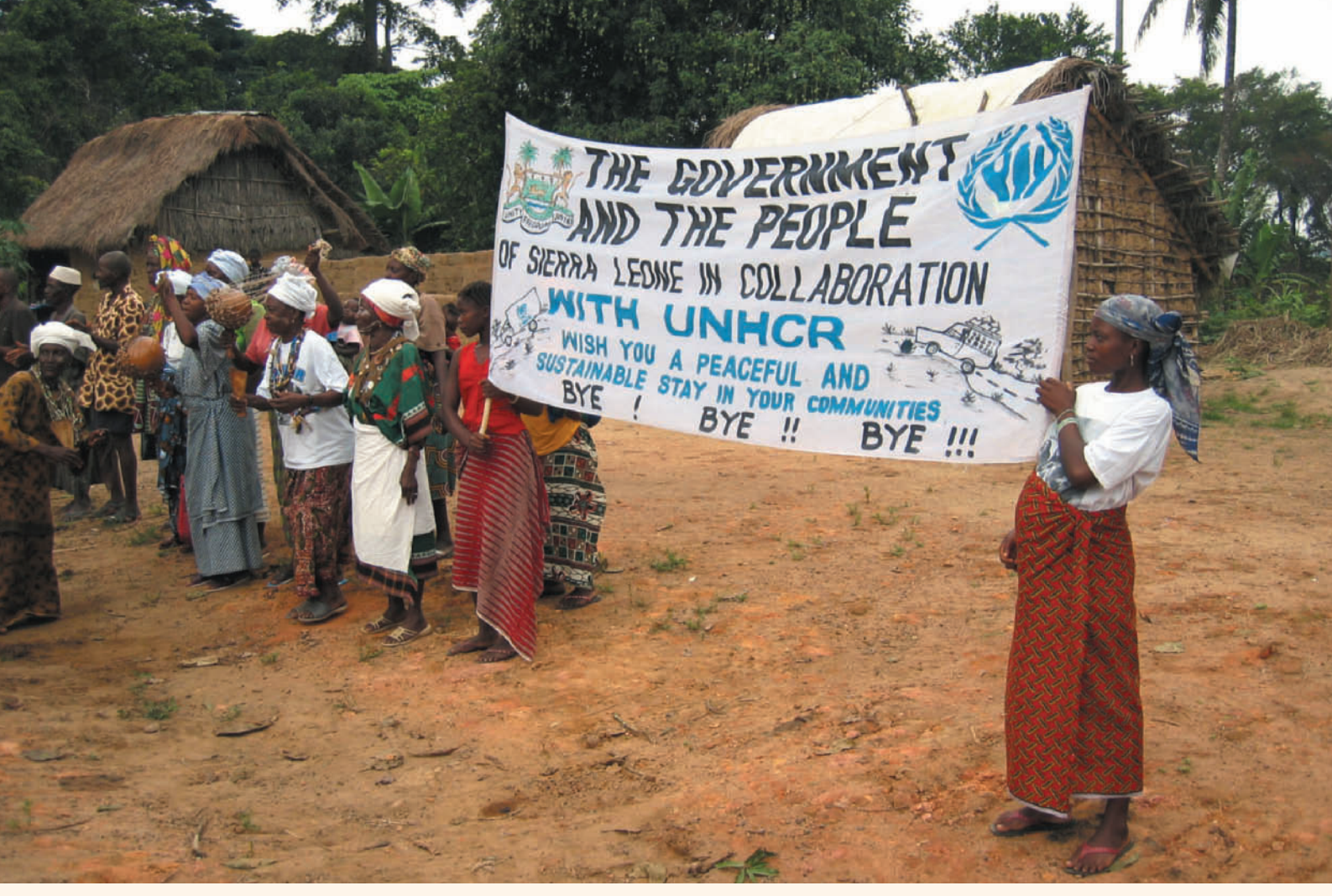
Sierra Leonean villagers wish Liberian returnees a safe journey home.

and local customs. A lawyer provided legal services to refugees and followed up 28 cases referred to court, including 11 related to allegations of sexual abuse. While a majority of the cases remained inconclusive due to lack of evidence and/or interference by family members, the referral of cases to court was in itself an achievement, since perpetrators of sexual violence had previously rarely been brought to justice.