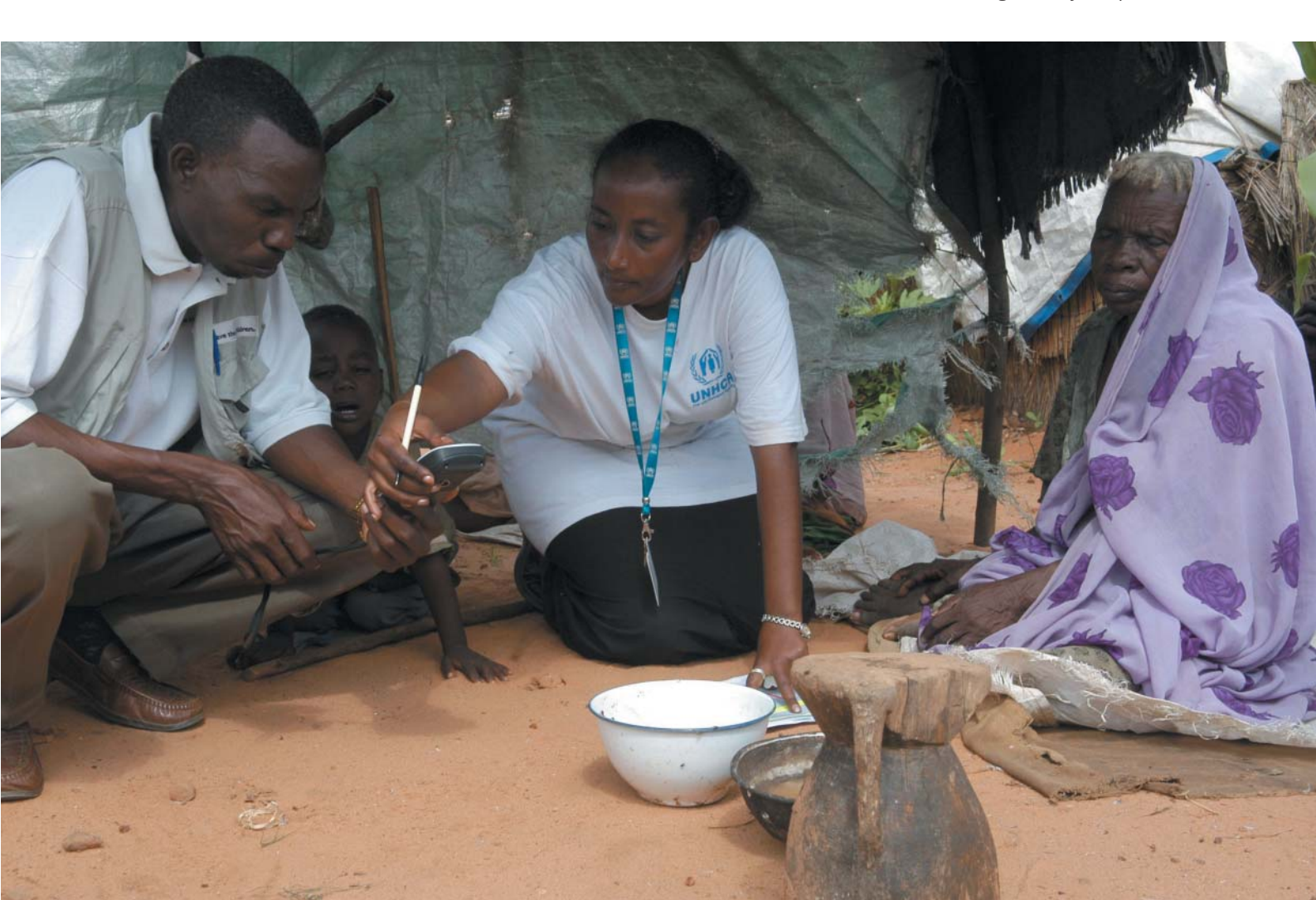
West Darfur, Sudan. By using GPS technology UNHCR can map out the location of vulnerable displaced people and thus ensure that they are protected and assisted.

UNHCR's country operations for Chad and Sudan are described in detail in the following country chapters.