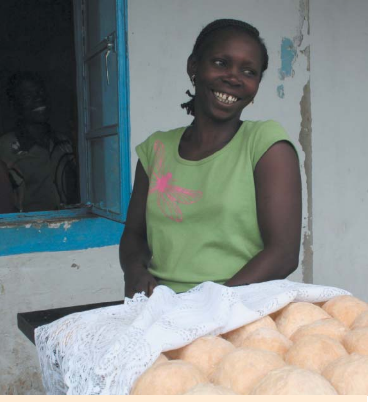
UNHCR's reintegration projects, like this bakery at the women's centre in Cazombo, are designed to be self-sustaining.

provincial strategies, will address key development gaps in the eight main districts of refugee return. These districts are spread through the border provinces of Moxico, Zaíre, Uíge, Lunda Norte and Kuando Kubango.