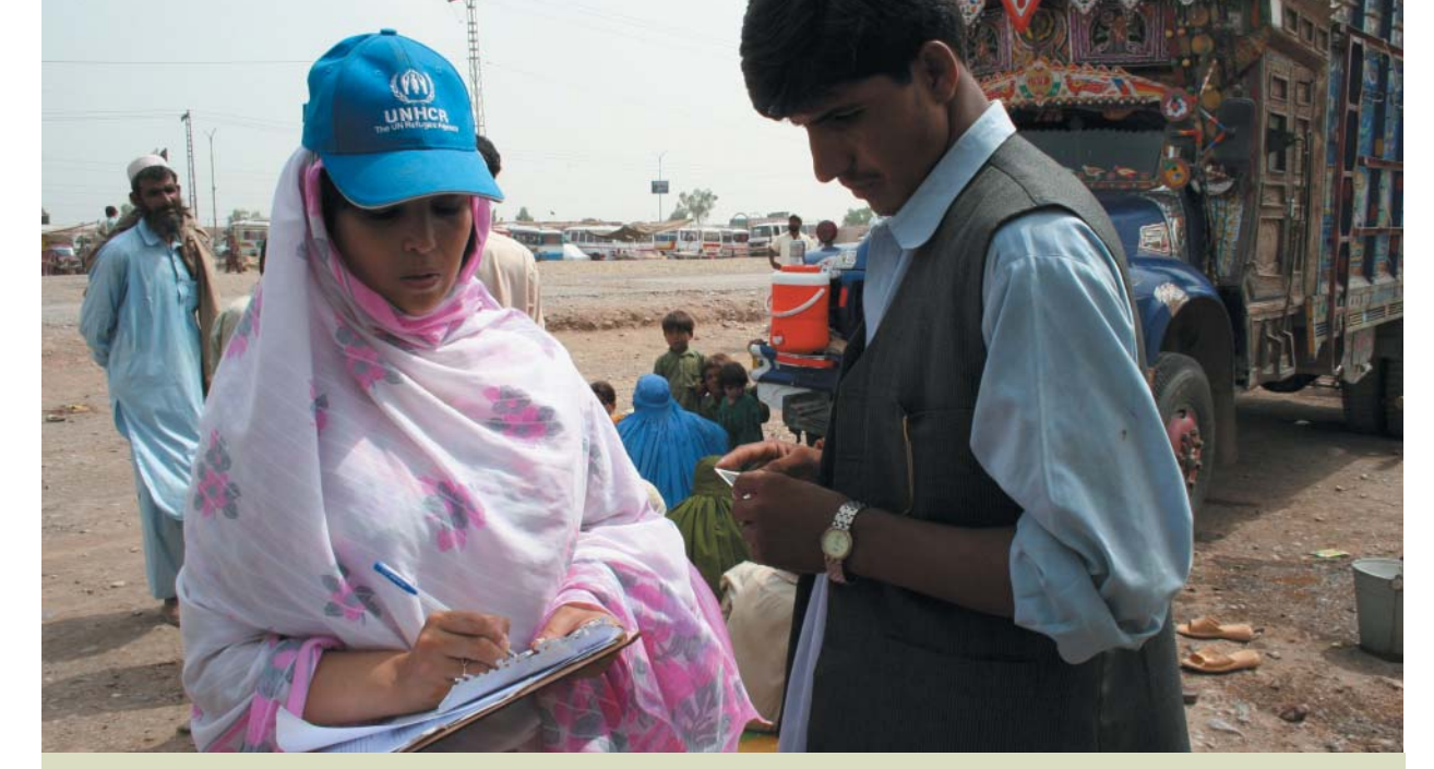
The UNHCR Iris Verification Centre in Hayatabad Peshawar marked the 100,000 Afghan return of the year in July 2006.

also continue refugee status determination for non-Afghans in need of international protection and pursue durable solutions through voluntary repatriation or resettlement.