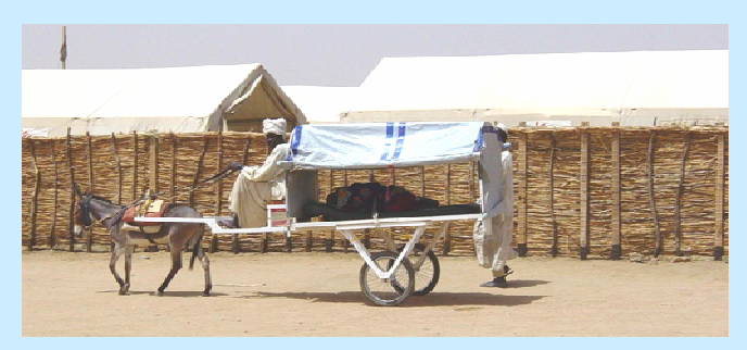
"Ambulance" in Chad 2005

*MDG 3: promote gender equality and empower women; MDG 4: reduce child mortality; MDG 5: improve maternal health MDG 6: Combat HIV/AIDS