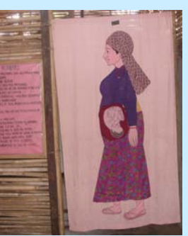
Mother and child health training, Nepal 2006