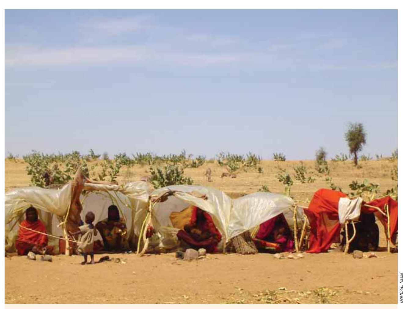
Some of the 10,000 IDPs and Chadian refugees who gathered in Galu and Azaza in West Darfur in early 2006.