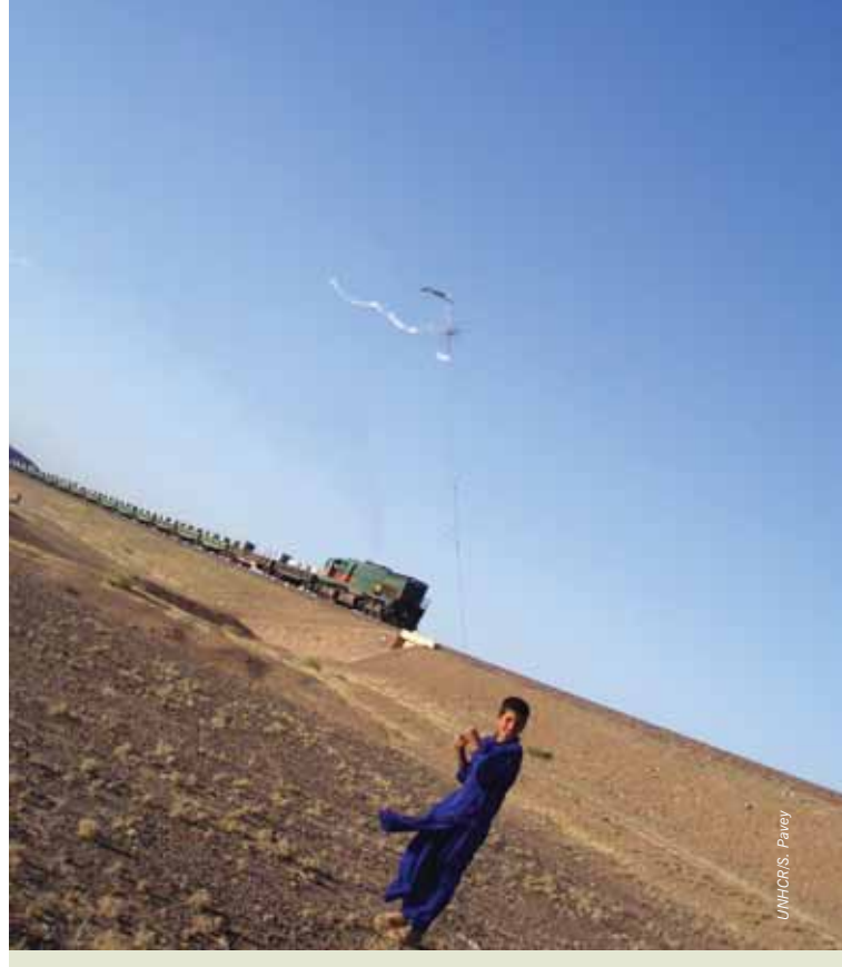
An Afghan refugee child flying his kite in Saveh camp, during the filming of "Wherever I go the sky is mine", which was produced for World Refugee Day.

Transport and logistics: More than 5,300 Afghan refugees were transported from the voluntary repatriation centres to the two border exit stations.