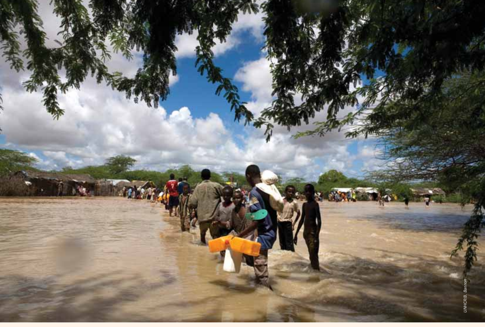
Some 78,000 refugees were affected by the floods. UNHCR provided food, non-food items and emergency shelter to those whose homes were destroyed.

Education: Although the average student-to-classroom ratio increased to 70:1 in primary schools, it remained at 40:1 in secondary schools. UNHCR provided textbooks, desks and other school materials and carried out peace education and adult literacy programmes.